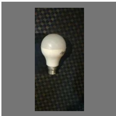
LED Bulb 7w