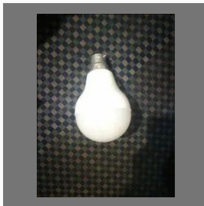
LED Bulb 9w