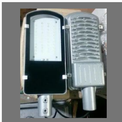
LED Street Light