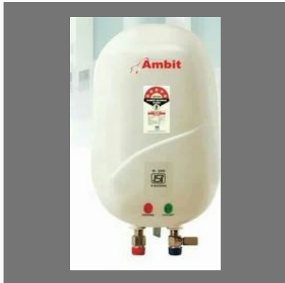
Electric Geyser ( Abs Body )