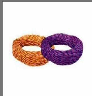
Alloy Flexible Wire