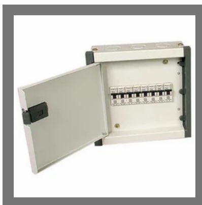
MCB Distribution Box (Double Door)