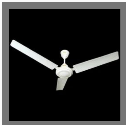
Ujala Ceiling Fan (HELICOPTER MODEL)