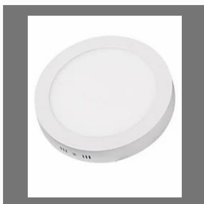
LED Panel Light