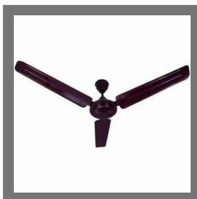
Ujalla Ceiling Fan (VYADOOT MODEL)