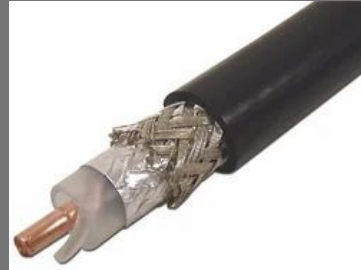
Co- Axial Cable