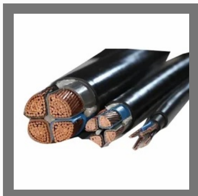
Aluminum Unarmored Cable