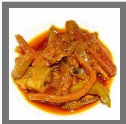
Mixed Vegetable Pickle