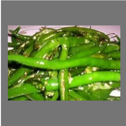
Green Chilli Pickle