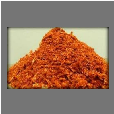
Idly Garlic Powder