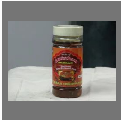
Chettinad Kuzhambu Mix