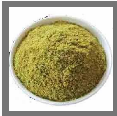
Curry Leaves Powder