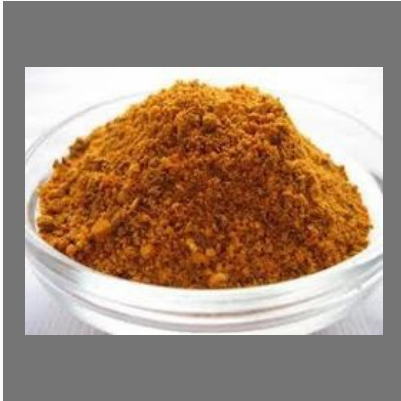
Vatha Kulambu Powder