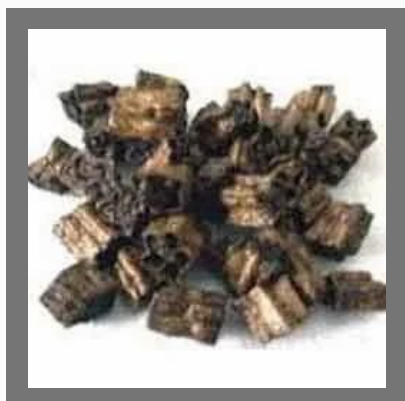
Ladys Finger Vathal