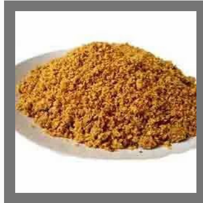
Andhra Dal Powder