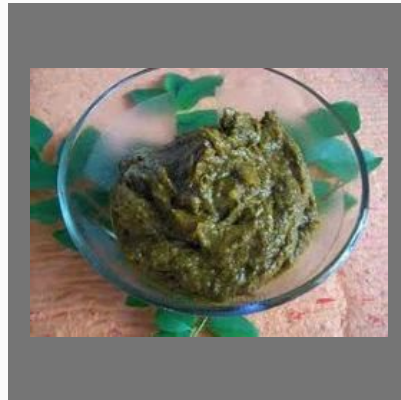
Curry Leaves Thokku