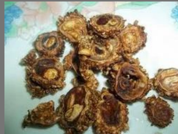
Bitter Guard Vathal