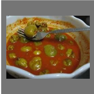
Vadu Mango Pickle