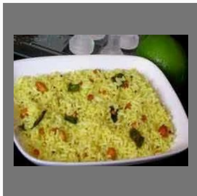
Lime Rice Mix