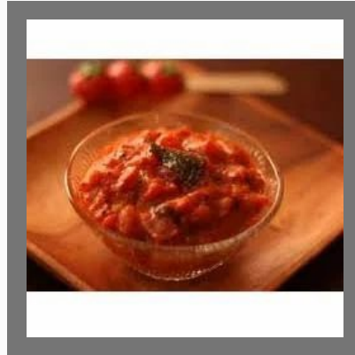
Cut Mango Pickle