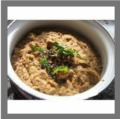
Pepper Rasam Paste