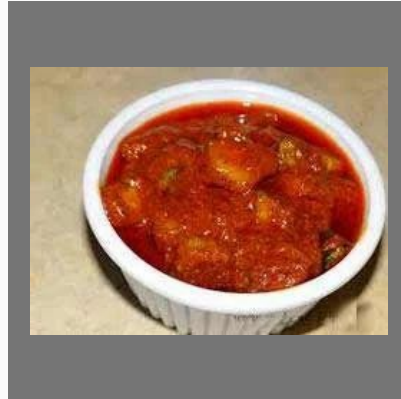
Tomato Rasam Paste