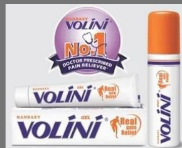
Ranbaxy Volini Gel