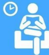
Cosmetic Surgery Treatment Services