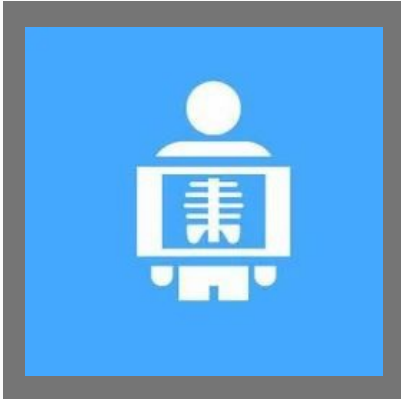
Diagnostic Imaging Treatment Services