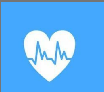
Cardiology Treatment Services