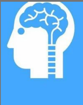
Neurology Treatment Services