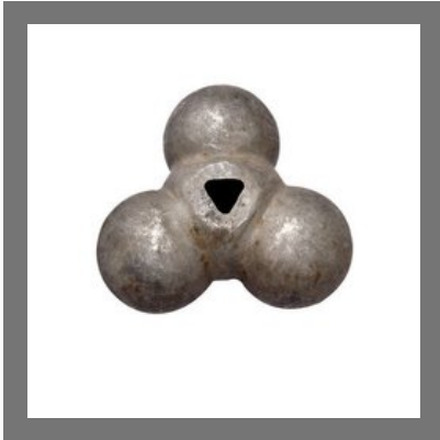
Machine Component CI Casting