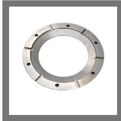
Mild Steel Washer Casting