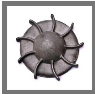
Mild Steel Pump Impeller Casting