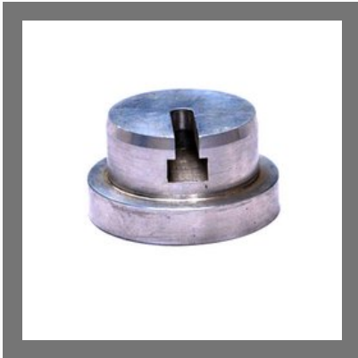
Machining Part CI Casting