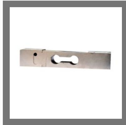
Machining Parts CI Casting