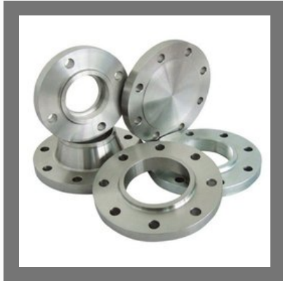
Mild Steel Flange Casting