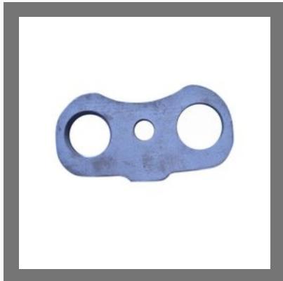
Mild Steel Casting Components