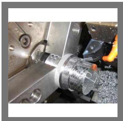
CNC Turning Machining Service