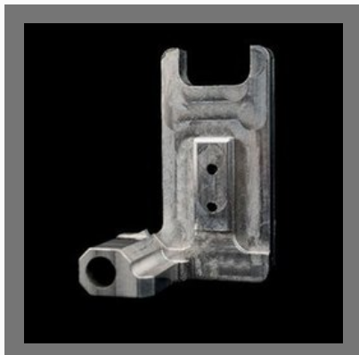
VMC Milling Machine Job Work