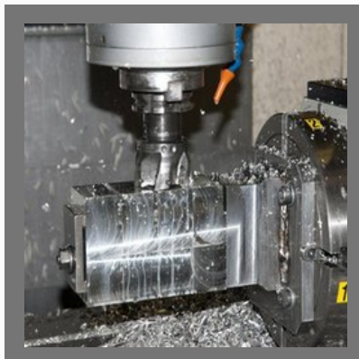
CNC / VMC Machining Services