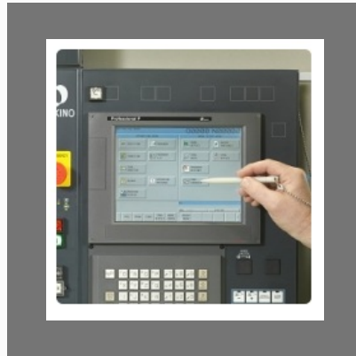
VMC Control Panel Repairing