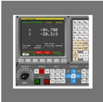
CNC Control Panel Repairing