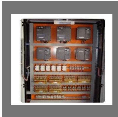
PLC Control Panel Repairing