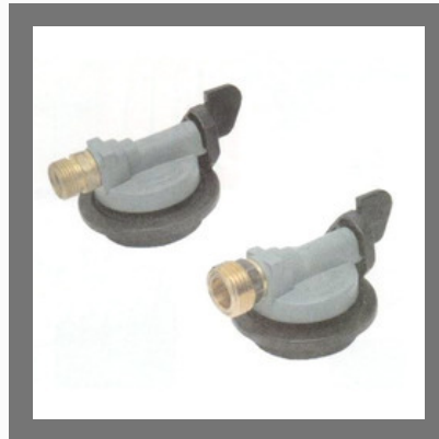
Multi Lock Bearing Adapter Manifolds Fittings