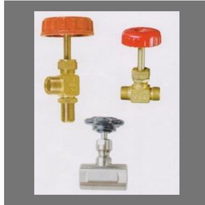
Needle Control Valves