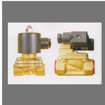
1 Way Tekno Diaphragm