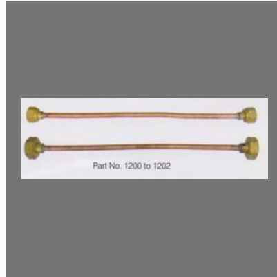
Copper Cylinder Pigtails