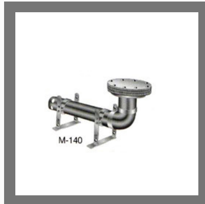
High Pressure Bulk Heating Burners