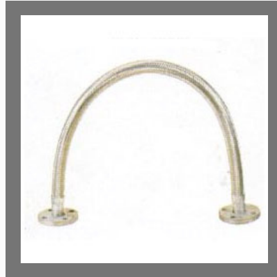
Heat Resistant Flange End Hoses