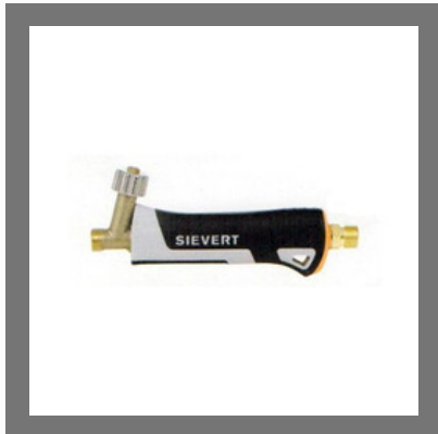
Classic Torch System