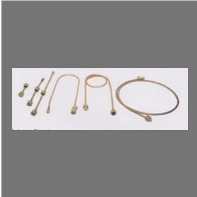
Copper Burner Pigtails