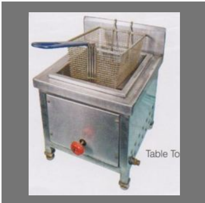
Table Top Deep Fat Frier