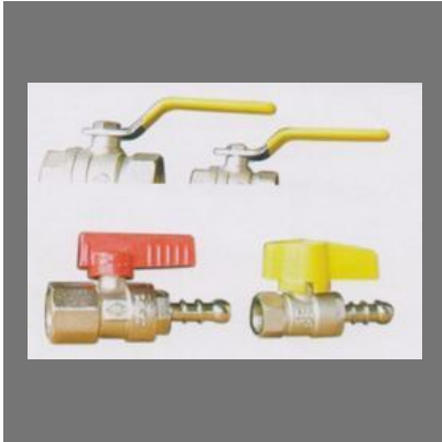
QT Ball Valves