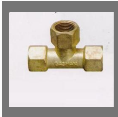
Female Three Way Tee