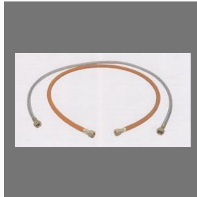
Flexible Burner Pigtails