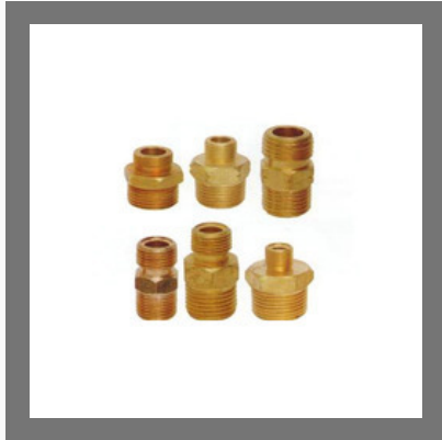
Adapters In Forged Brass