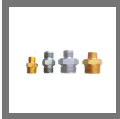
Couplings In Forged Brass