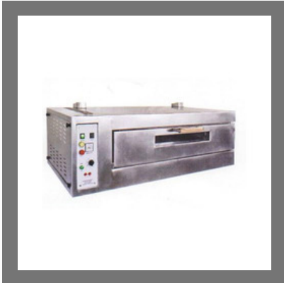
Bakery Pizza Oven