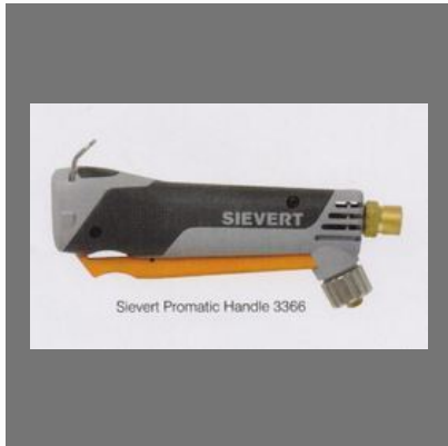
Universal Torch System