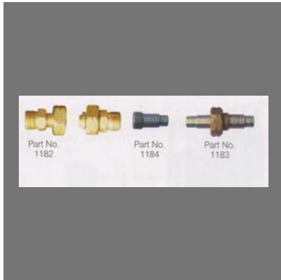
LPG Manifolds Fittings