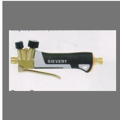
Heavy Duty Torch System