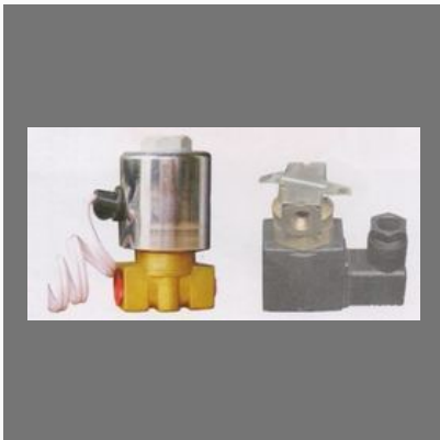
Tekno Solenoid Valves