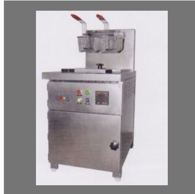
Deep Fat Frier