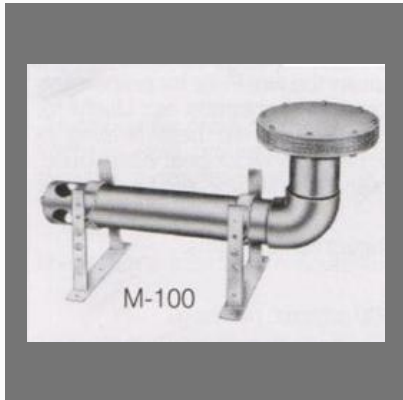
High Pressure Bulk Heating Burners