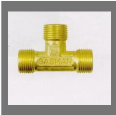
Male Three Way Tee