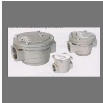
Elektrogas And Tork Gas Fillters