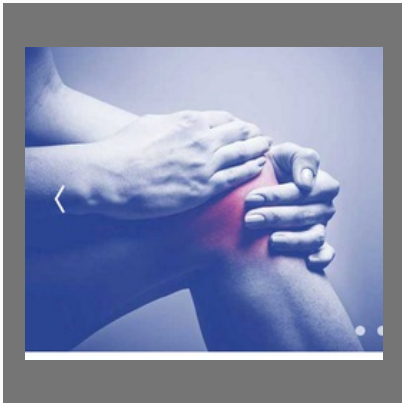
Pediatric Orthopaedics Services