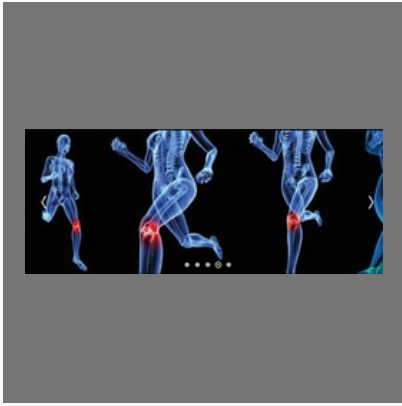
Spine Surgery Service