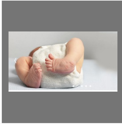
Spine Care Service