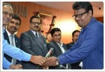
Company Registration Consultation