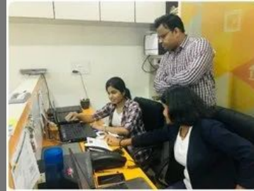
IMPORT EXPORT CODE 1 DAY