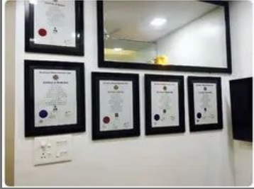
Pan Card Consultants