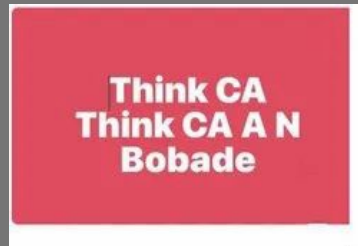
LLP Registration Service