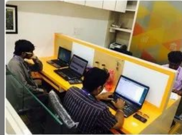
LLP Annual Return ( Form 8, Form 11)