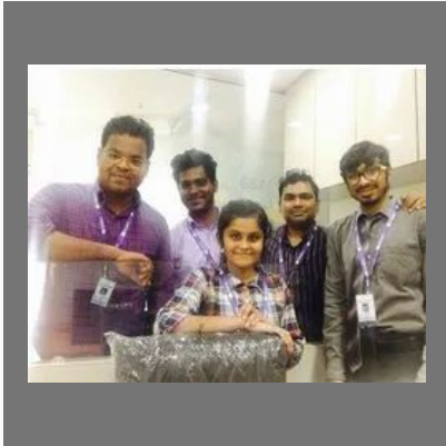
GST Registration Services