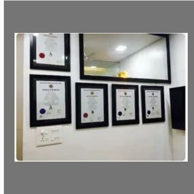
GST RETURN FILING SERVICES