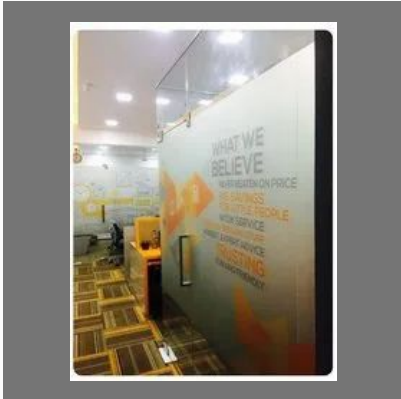
Income Tax Return Filing Service