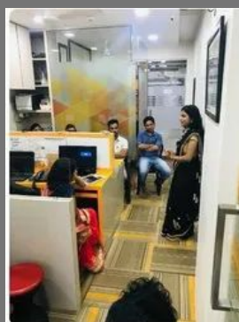
Corporate And Financial Advisory