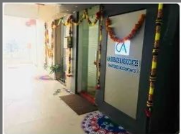
Company Registration Service