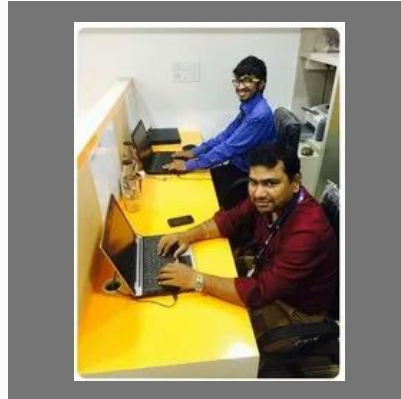
Pan Card Service