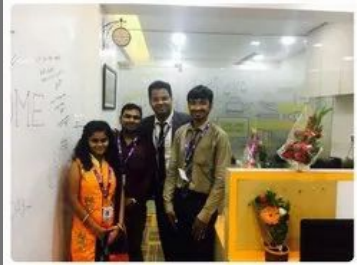
Audit And Assurance Service