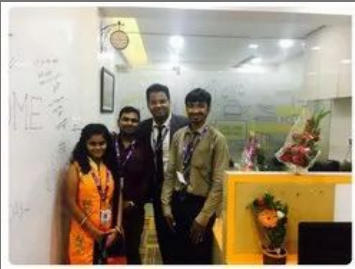
MSME Registration Consultancy Service 1 Day