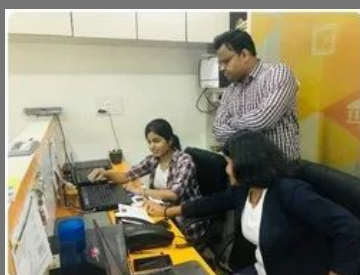
Food License Service