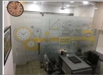
Shop Act Licence