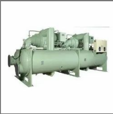
Scroll Screw And Centrifugal Chiller