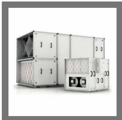
Double Skin Air Handling Unit