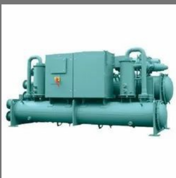
Automatic Water Cooled Chillers