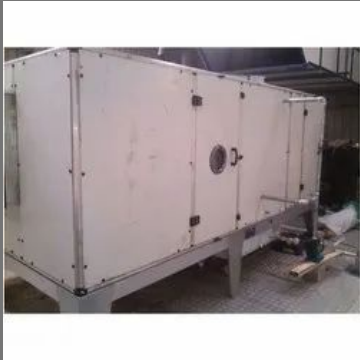
Air Washer And Scrubber