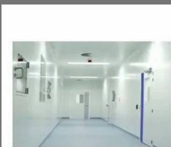
Clean Room Structures