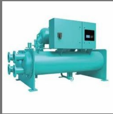
Water Cooled Screw Chiller