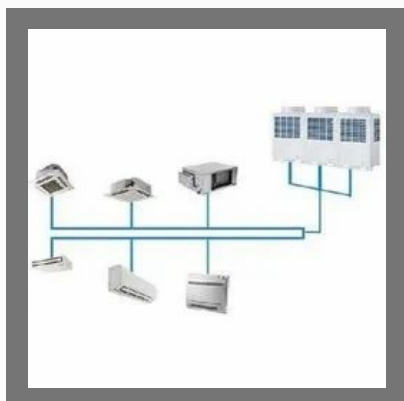
Residential Variable Refrigerant System