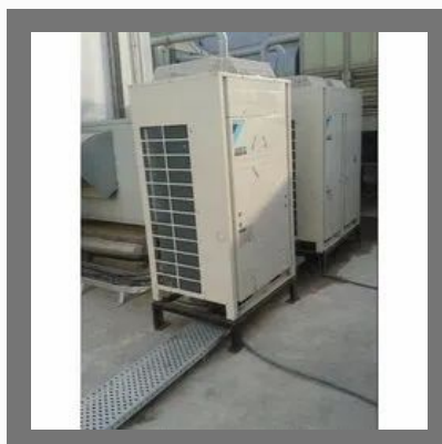
Variable Refrigerant Volume System