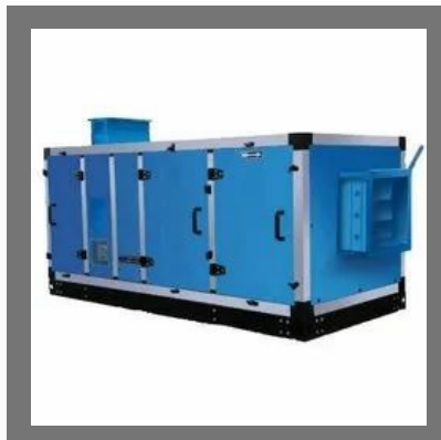
Chiller Air Handling Unit