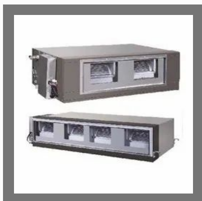
3 Ton Ductable Air Conditioner