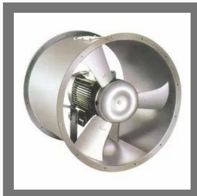
Industrial Centrifugal And Axial Fans