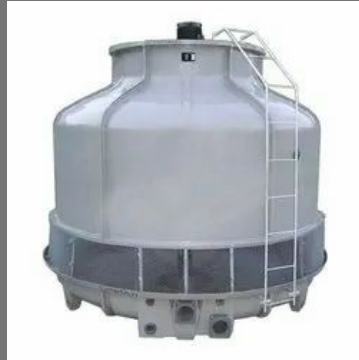
Industrial Cooling Tower System