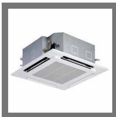
Cassette Automatic Air Conditioners