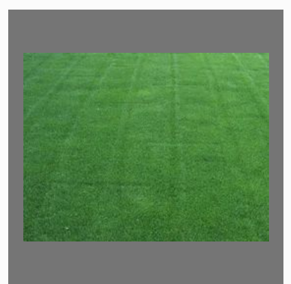
Grass Plantation Services