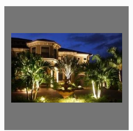
Landscape Development Services