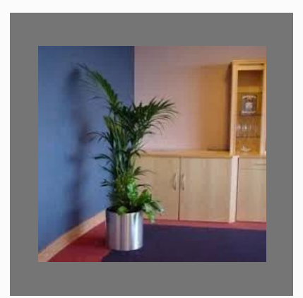
Indoor Plants On Rent/Rental Services