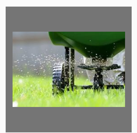
Grass Cutting Service