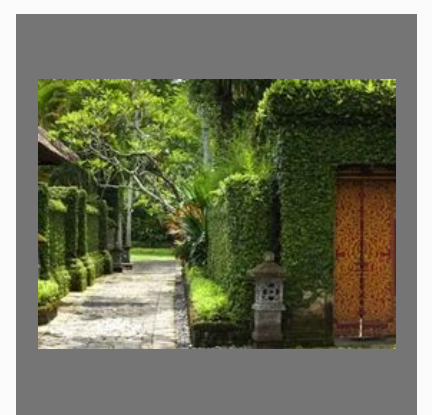
Green Wall Landscape Services