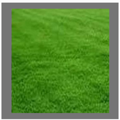
Turfing Work Service