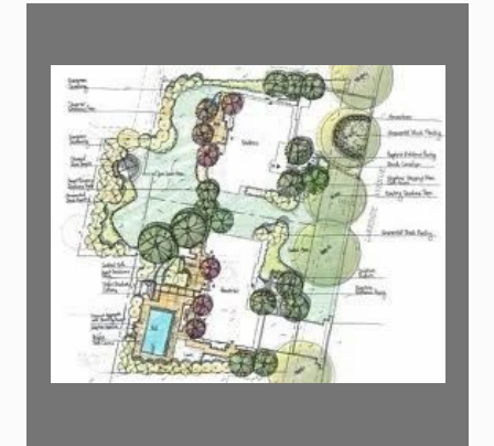
Landscape Design Services