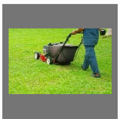
Lawn Care Services