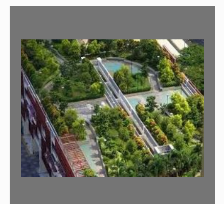
Terrace/Roof Garden Design & Development Services