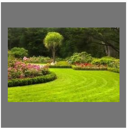
Garden Development Services