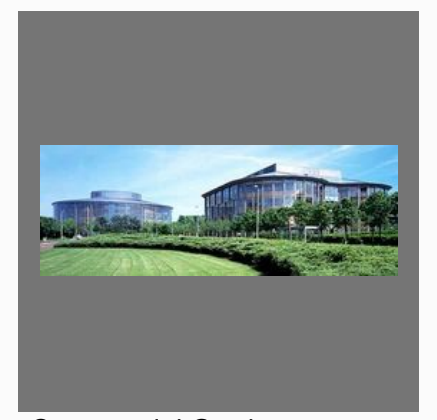
Commercial Garden Maintenance