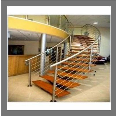
SS Staircase Railing