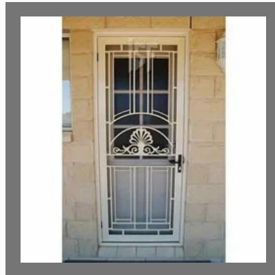
SS Window Design