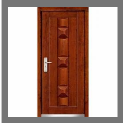
Wooden Entry Door