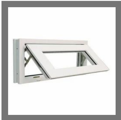
UPVC Top Hung Window