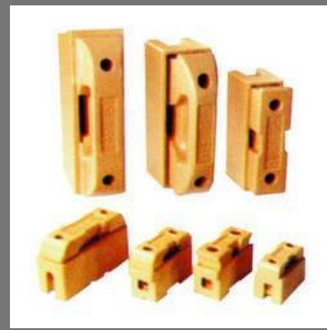
Porcelain Fuse Unit