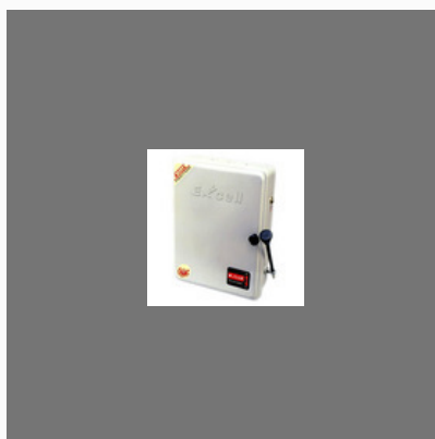
Miniature Circuit Breaker