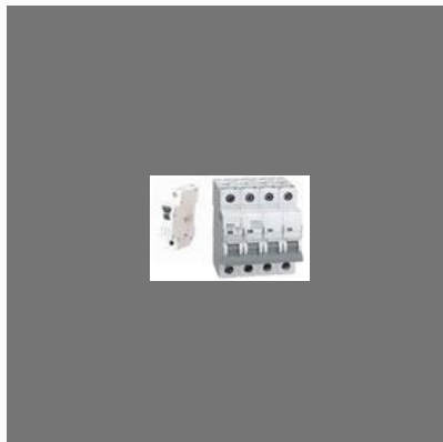
Fuse Switch Unit ( Hrc Fuse Type)