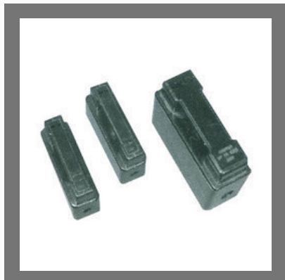
Bakelite Fuse Fittings