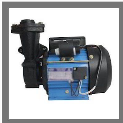
Domestic Self Priming Pump