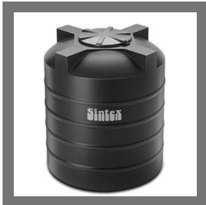
Sintex Water Tank 5000 Ltr