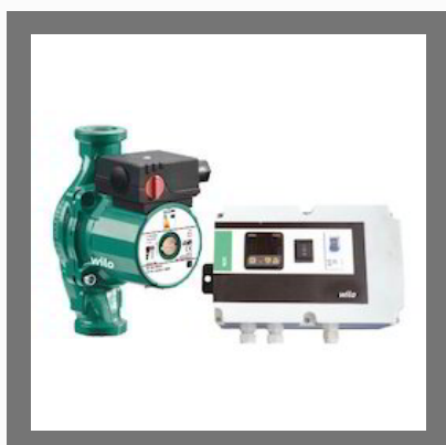
Hot Water Circulation Pump