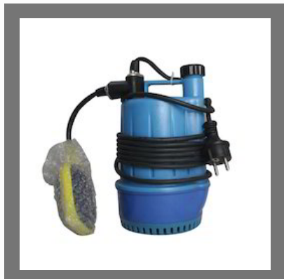
Plastic Dewatering Pump