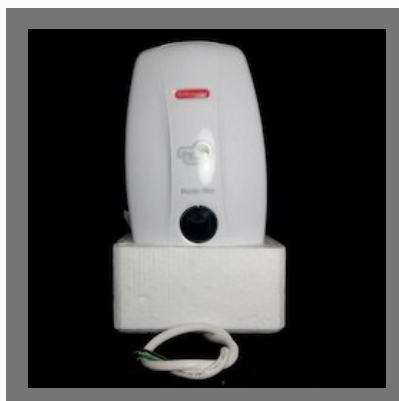
RACOLD Water Heater