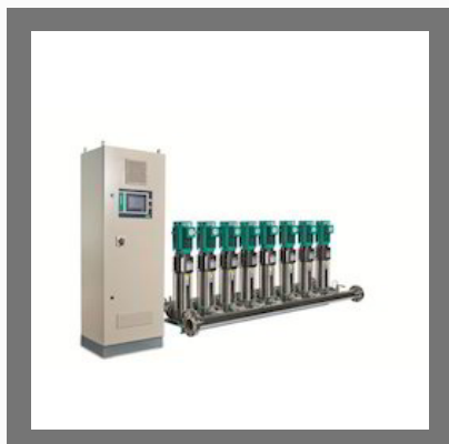
Hydropneumatic System Wilo