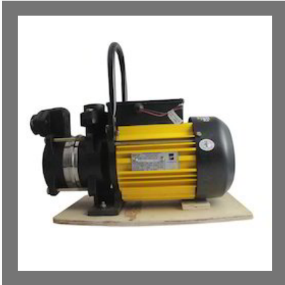
Kirloskar 1.5 HP Booster Pump