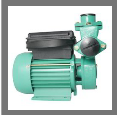
Cast Iron Monoblock Pump