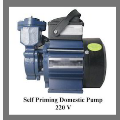
Self Priming Domestic Pump 220 V