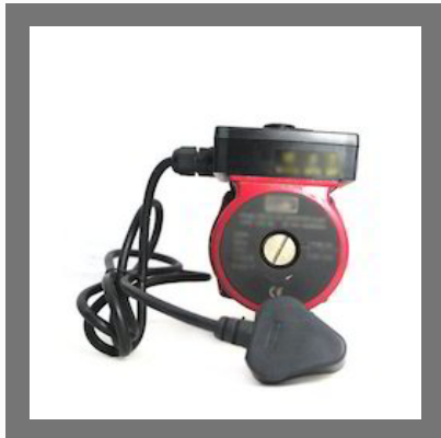
Pressure Water Pump Circulatory Lubicamt