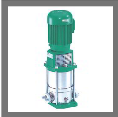
Multi Stage Inline Vertical Pump