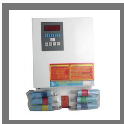
Automatic Water Level Control