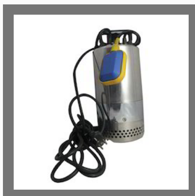
Stainless Steel Dewatering Pump