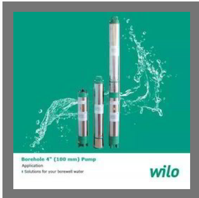
Submersible Borewell Pumps