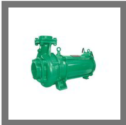
Openwell Submersible Pump Wilo