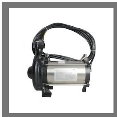
Wilco submersible Pump