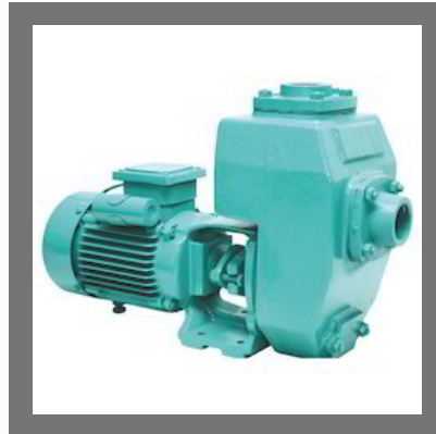
Non Clog Monoblock Dewatering Pump