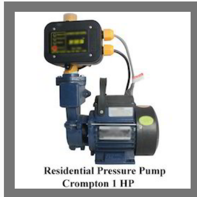
Residential Pressure Pump Crompton 1 HP Pressure Pump Crompton 1 HP