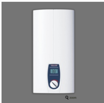
stiebel eltron water heater