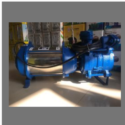
SUBMERSIBLE BOOSTER PUMP (ATC)