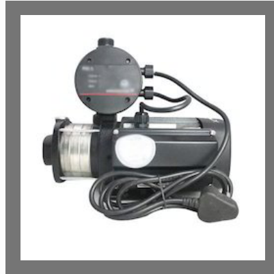
Pressure Pump Grundfos