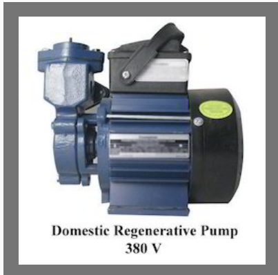
Domestic Regenerative Pump 380 V