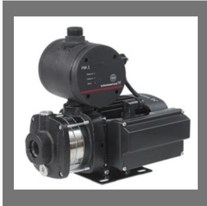
Grundfos Pressure Pump