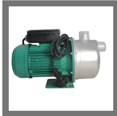
SS Water Pump Wilo