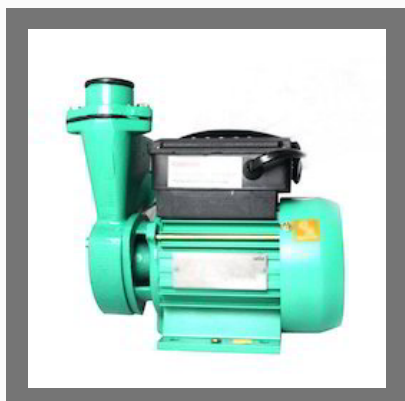
Wilo self priming Domestic Silent Pump