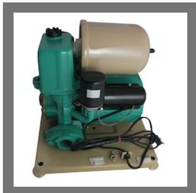
Pressure Water Pump