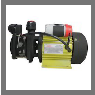
Booster Water Pump