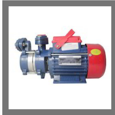
Crompton Booster Pump 0.5 HP