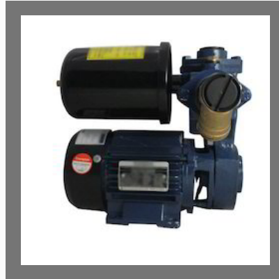
Booster Pump ATC