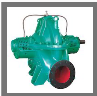
Mounting Inline Horizontal Split Casing Pump