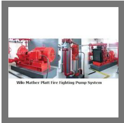
Fire Fighting Pumps