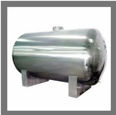
Storage / Jacketed / Insulation Vessel / Tank