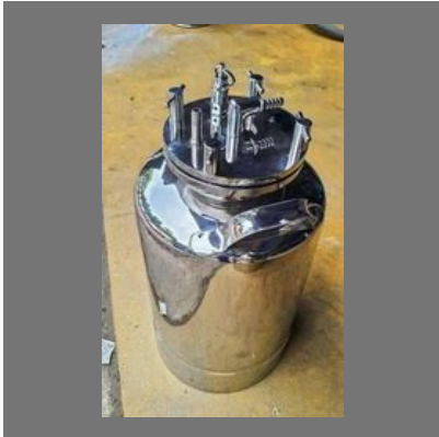
Sterile Pressure Vessel