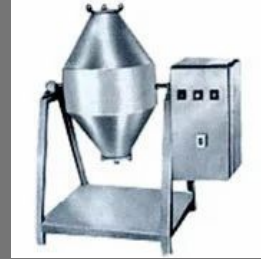
Double Cone Blenders