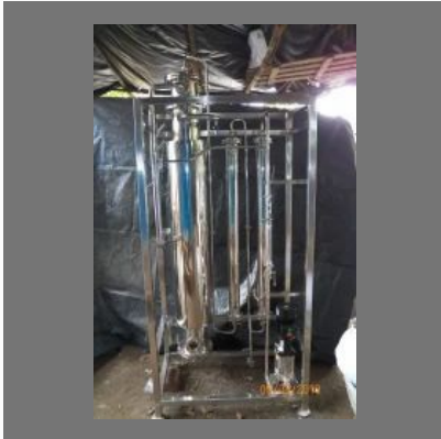
Pure Steam Generator