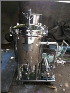
Sparkler Filter Press