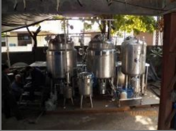
Sugar Syrup Preparation Plant