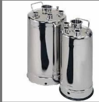
Stainless Steel Pressure Vessels