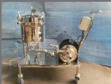
Sparkler Filter Press