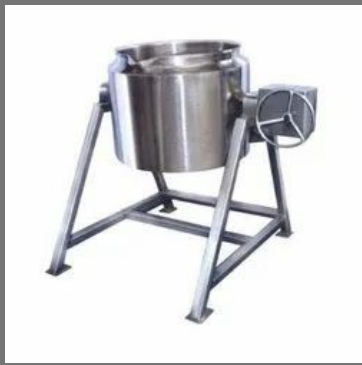
Motorized Tilting Paste Kettle