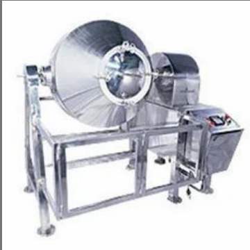
Double Cone Blender