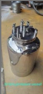
Fluid Transfer Pumps