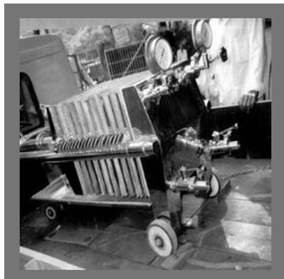
Plate And Frame Filter Press