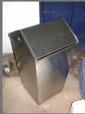
Bin For Ceep Use Dress