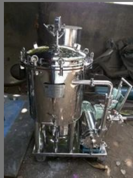
Horizontal Filter Press