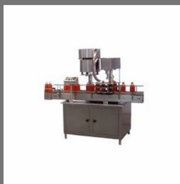
Cap Sealing Machine