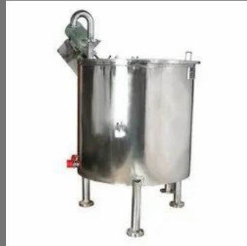
Syrup Making Kettle