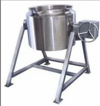
Manual Tilting Paste Kettle