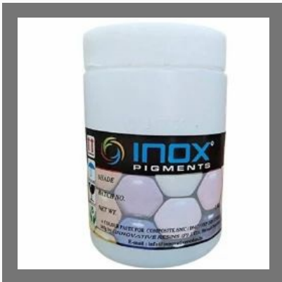
Inox Polyester Pigment Paste service