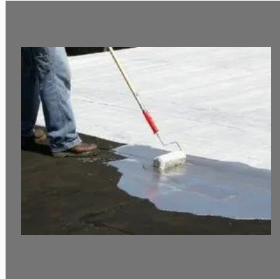
Industrial FRP Roofing Service