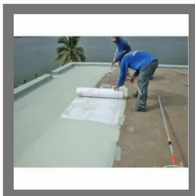
FRP Waterproofing Services