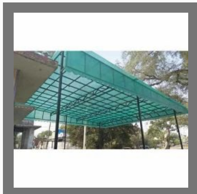
FRP Shed Lining Services