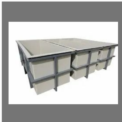
Tank FRP Lining Services