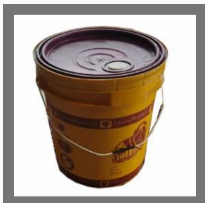
ShaliFloor SL UL 3 ES Self Leveling Underlay service