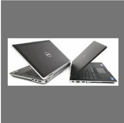
Dell Laptop E6330 I5/4gb/320 Gb