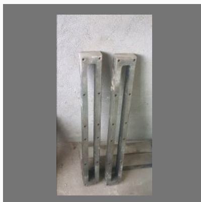
Precision Machined Components