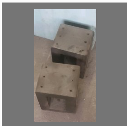
Pressure Die Casting Dies