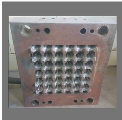
Plastic Injection Moulds