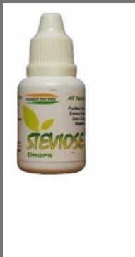
Steviose Sweet Drops