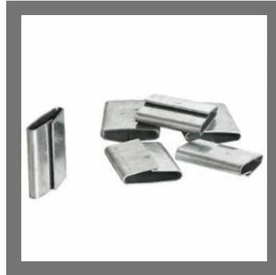
Steel Strapping Lapover Seal