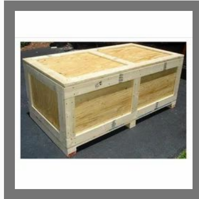
Rectangular Wooden Box