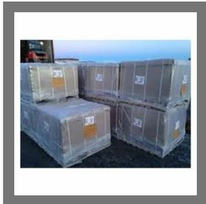
White LDPE Cover