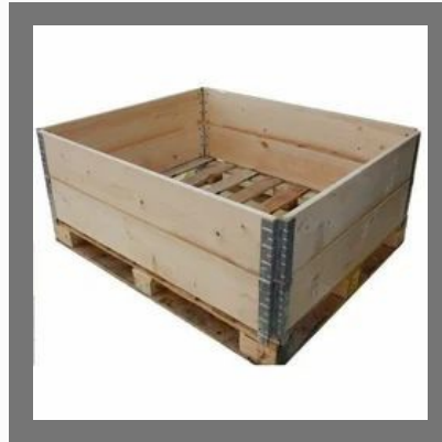
Wooden Jumbo Box