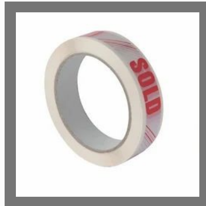
Printed Packaging Tape