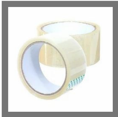
BOPP Transparent Tape