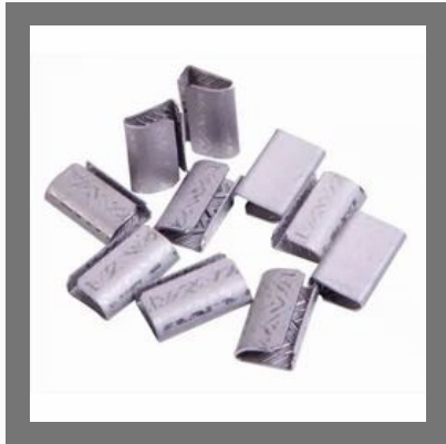
Pet Strap Seal