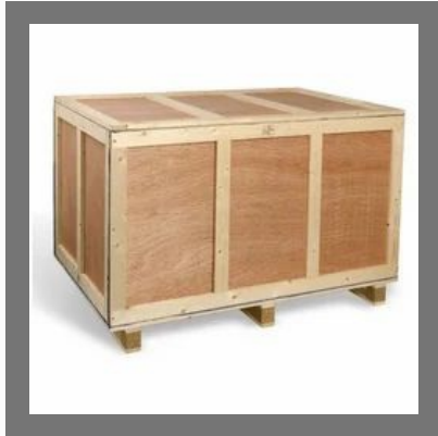
Fumigated Rectangular Wooden Box