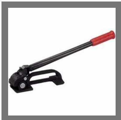
Manual Strapping Tools