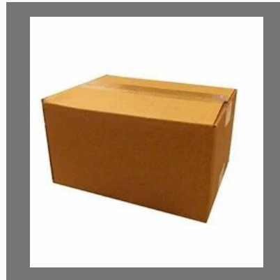
Corrugated Carton Box