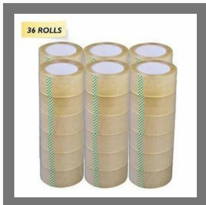
BOPP Packing Tapes