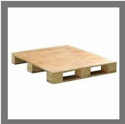
Plain Wooden Pallet