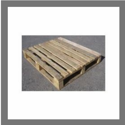
Industrial Wooden Pallet