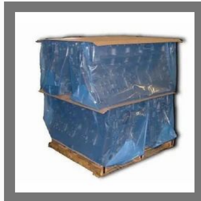
Blue LDPE Cover