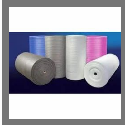
EPE Foam Colouring Roll