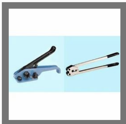
Imported Manual Tools