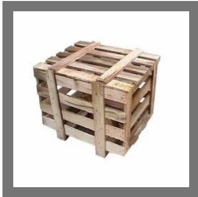
Fumigated Wooden Box