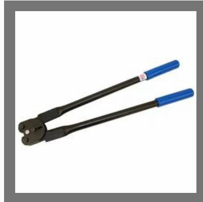
Heavy Duty Double Notch Steel Strapping Front Action Sealer