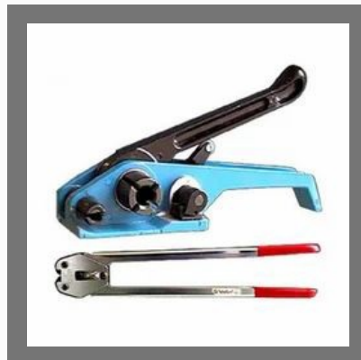
Imported Manual Tools