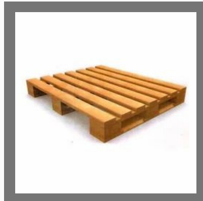
Stringer Wooden Pallet