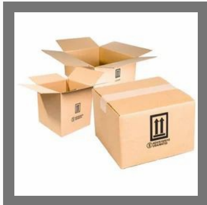
Corrugated Packaging Box