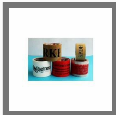
Colored Bopp Tape