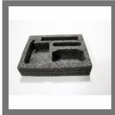
EPE Foam Tray