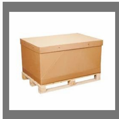
Plain Corrugated Box