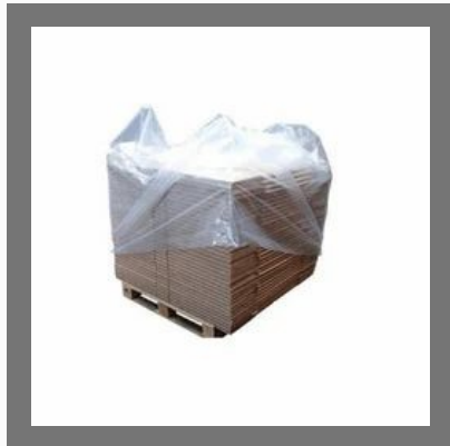
Transparent LDPE Cover