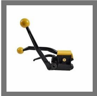
Strap Steel Strap Manual Tools (Seamless)