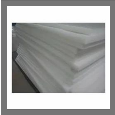
White EPE Foam Sheet