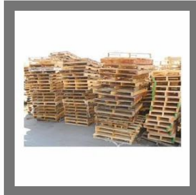
Mix Wooden Pallet