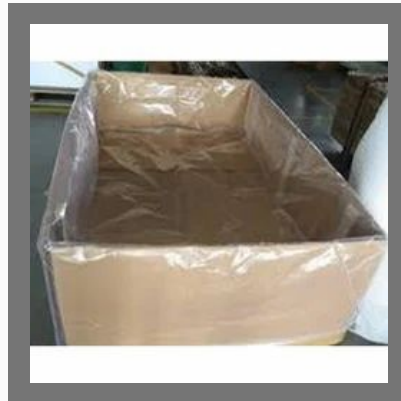
Transparent LDPE Cover