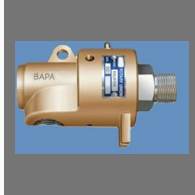
Hydraulic Rotary Union