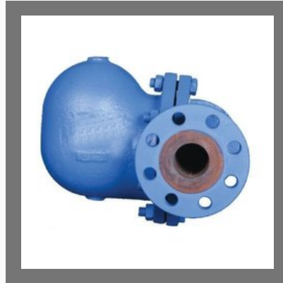
Ball Float Steam Trap