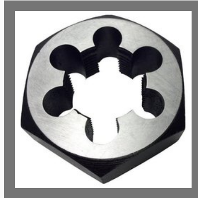
Carbide Hex Die