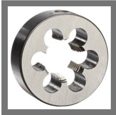
Carbide Threading Dies