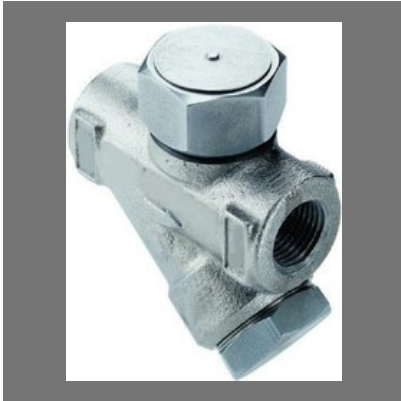
Thermodynamic Steam Trap