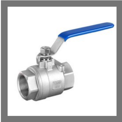
Stainless Steel Ball Valve