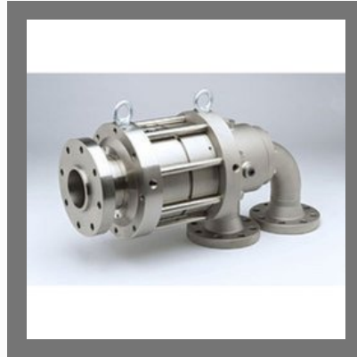
Flange Rotary Joint