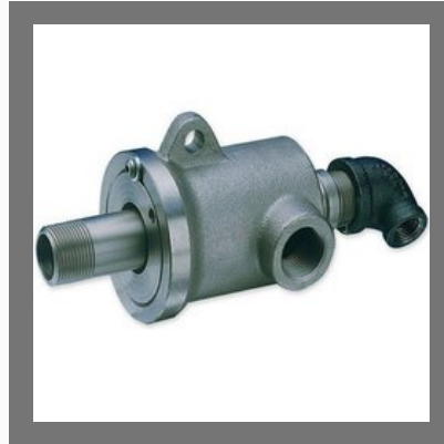
SS Rotary Joint