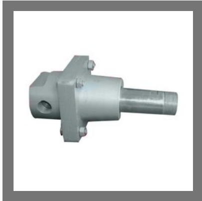
Rotary Pressure Joints