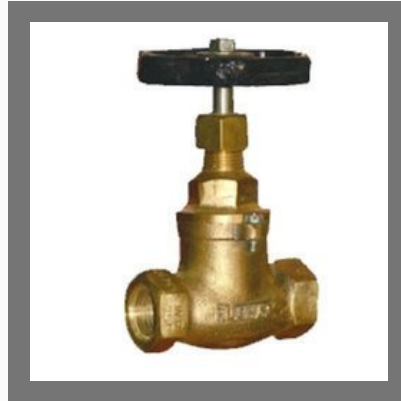
Steam Control Ball Valve