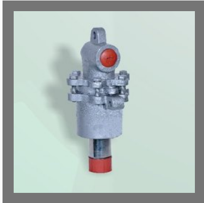
Hot Oil Rotary Joint