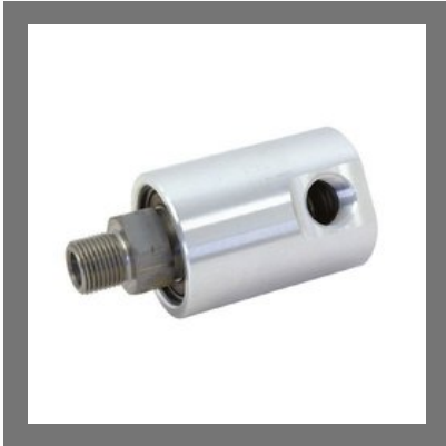
Pneumatic Rotary Joint