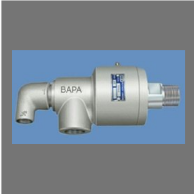
Air Oil Rotary Union