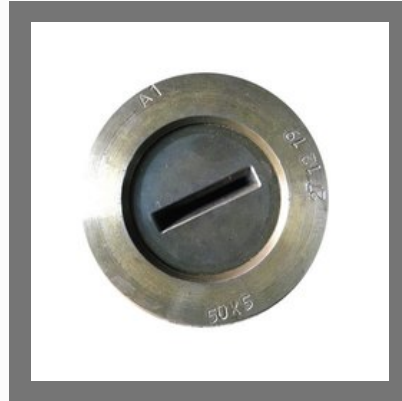
40 Mm Tungsten Carbide Drawing Die