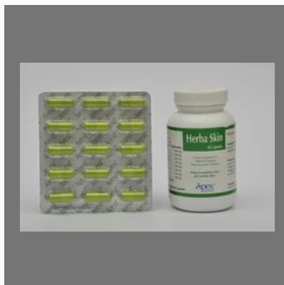
Acne and Skin Infections