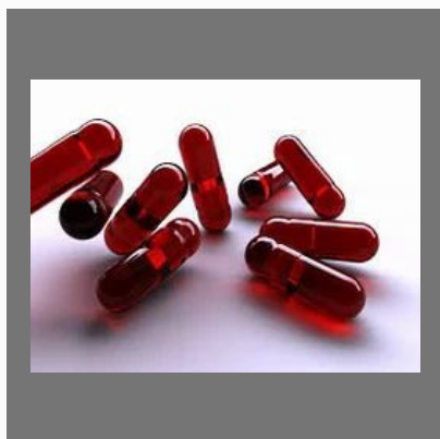
Gingivitis Oral Health