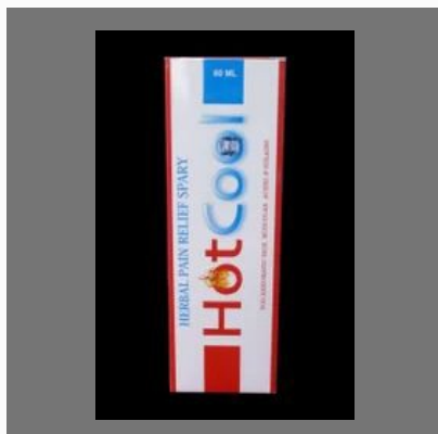
Herbal Pain Relieving Spray