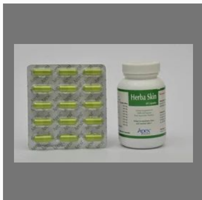
Acne and Black Heads