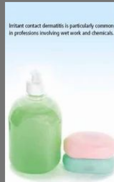
Atopic Dermatitis Medicine