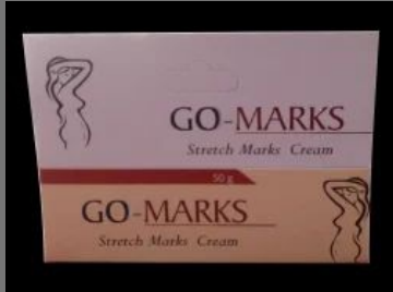
Stretch Marks Cream