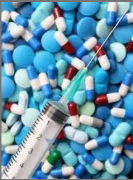
Atopic Dermatitis Medicine