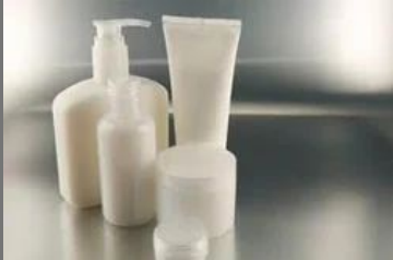
Stretch Marks Cream