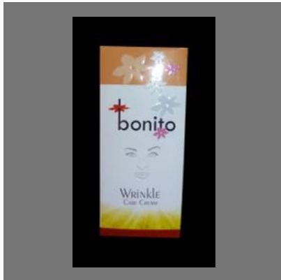
Bonito Wrinkle Care Cream