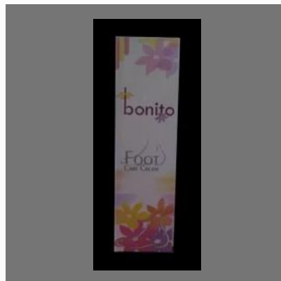
Bonito Foot Care Cream