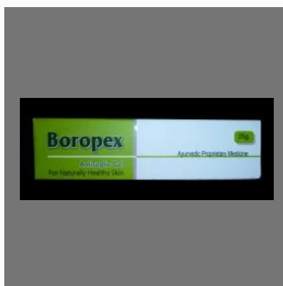
Boropex Herbal Antiseptic Gel