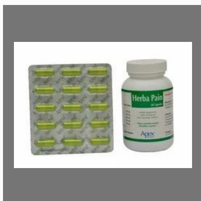
Arthritis & Joint Pain Herbal Supplements