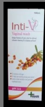
Inti V Female Personal Hygiene Wash