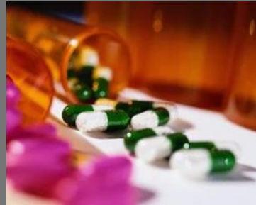
Stretch Marks Medicine