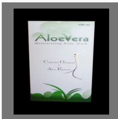
Aloe Vera Moisturizing Body Wash