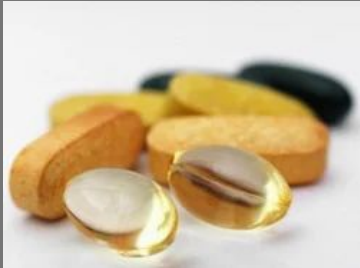
Vitamins and Supplements