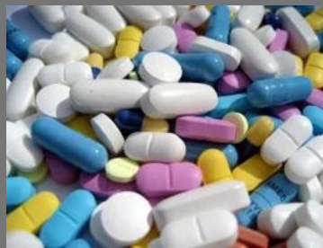
Spine Flexibility Drugs