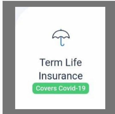
Term Life Insurance Services