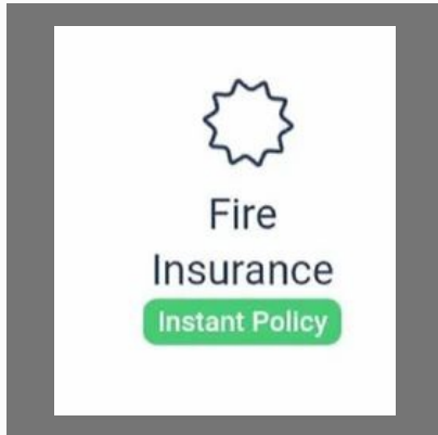
Fire Insurance Services