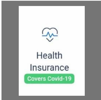
Health Insurance Service