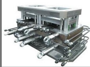
Pressure Die Casting