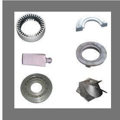
Gravity Die Casting