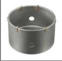
Foundry Patterns & Core Bosch