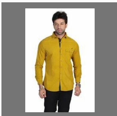
Casual Shirts- Mustard