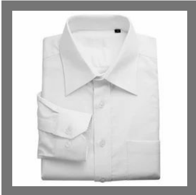
Mens Cotton Shirts