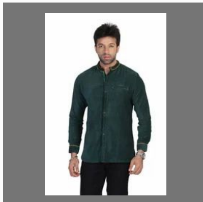
Casual Shirt- Olive