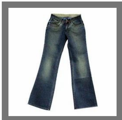
Mens Denim Jeans