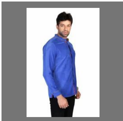
Casual Shirt- R. Blue