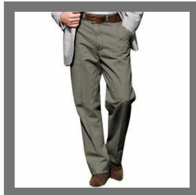
Mens Cotton Trousers