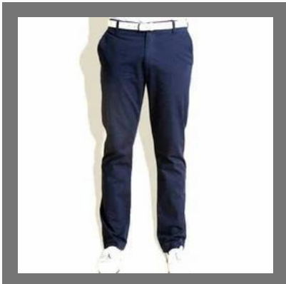
Mens Casual Trousers