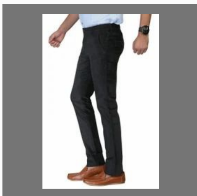
Casual Trouser- Navy