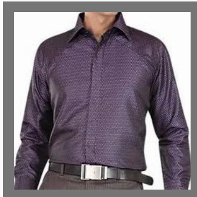
Mens Party Wear Shirts