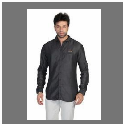
Casual Shirt- Black