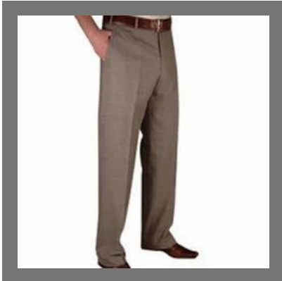
Mens Formal Trousers