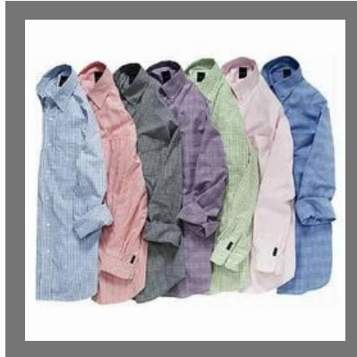
Mens Casual Shirts