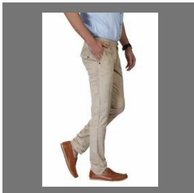
Casual Trouser- Fawn