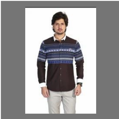
Casual Shirt- Brown