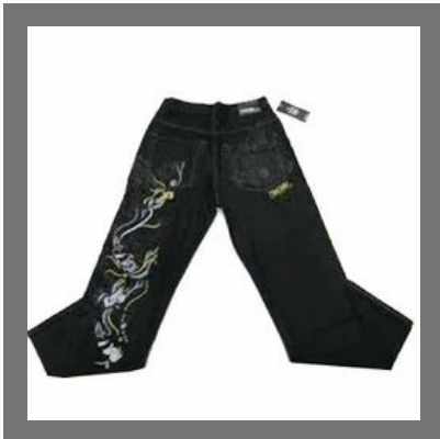
Mens Designer Trousers