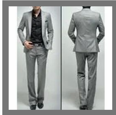
Mens Party Wear Trousers