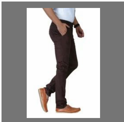
Casual Trouser- Brown