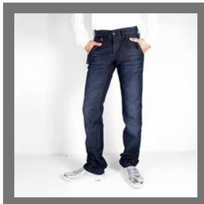
Mens Designer Jeans