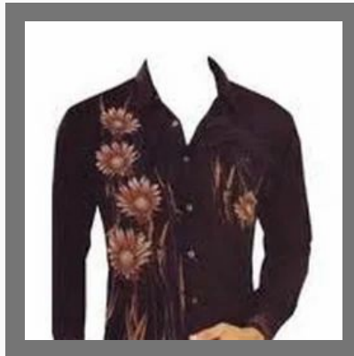
Mens Designer Shirt