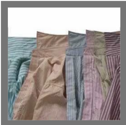
Mens Formal Shirts