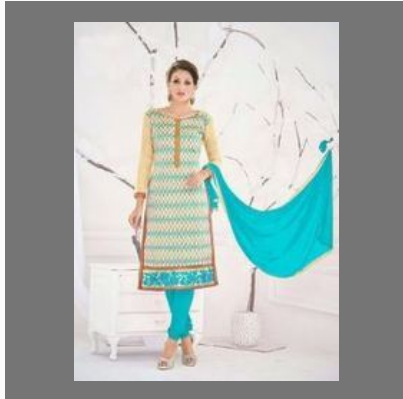
Chanderi Unstitched Salwar Suit