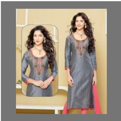
Grey Glaze Cotton Suit