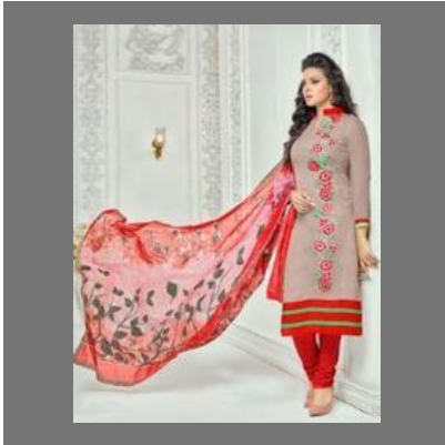
Chanderi Cotton Suit