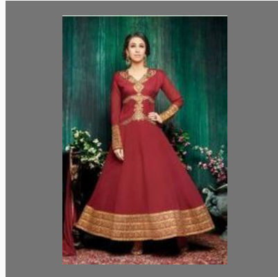
Georgette Net Salwar Suits