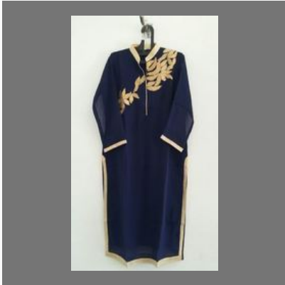
Blue and Gold Georgette Kurti