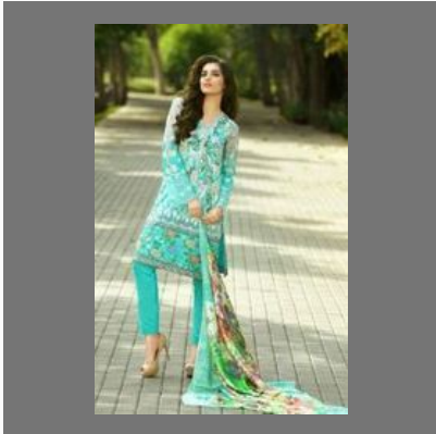
Lawn Cotton Unstitched Salwar Suit