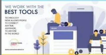
Customer Care Service Provider