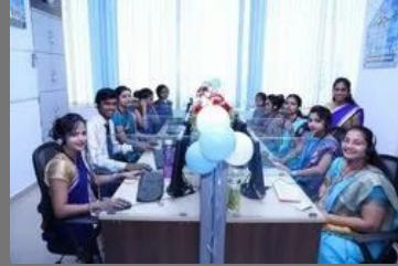
BPO Call Center Services Provider