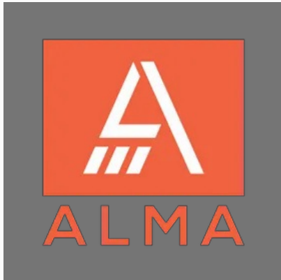
Business Process Management