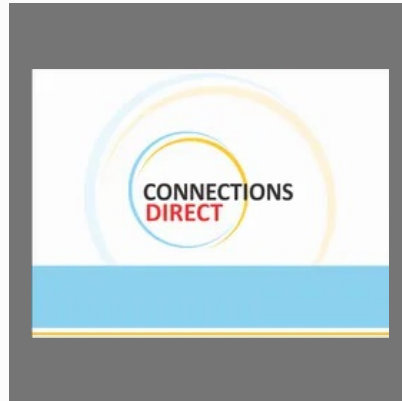
Call Center Services