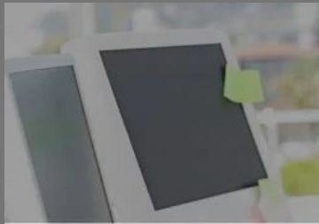
Business Process Outsourcing