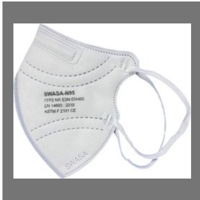
Original Swasa N95 Mask