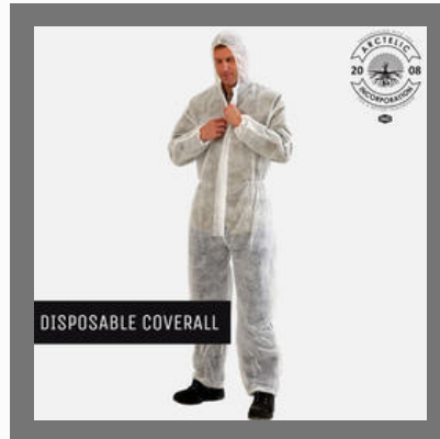
Disposable Coverall Apron