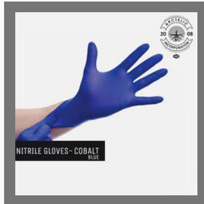
Nitrile Gloves Cobalt Blue