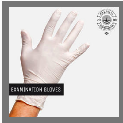
Latex Examination Gloves