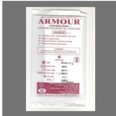
Armour Surgical Gloves Sterile & Non Sterile Powder Free