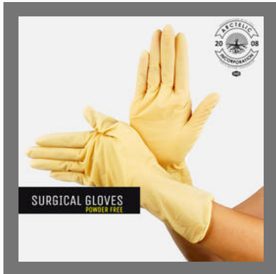
Latex Surgical Gloves