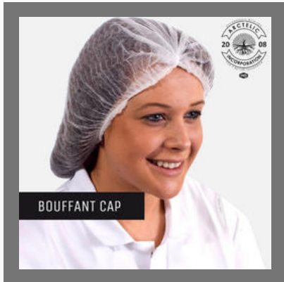
Disposable Bouffant Cap