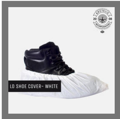
Shoe Cover LD PE White