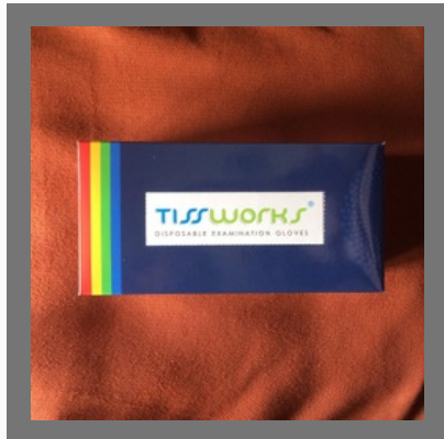
TissWorks Nitrile Gloves