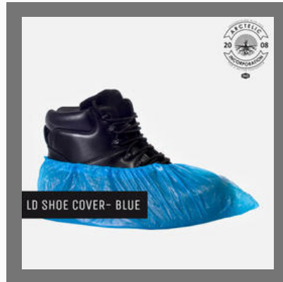
Blue Disposable Shoe Cover