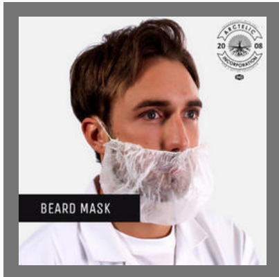
Disposable Beard Mask