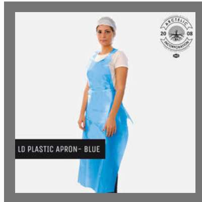
Blue Disposable Plastic Apron