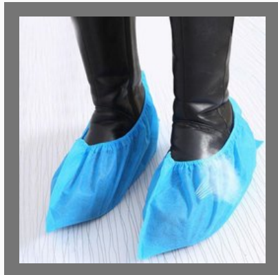
Non Woven Shoe Cover