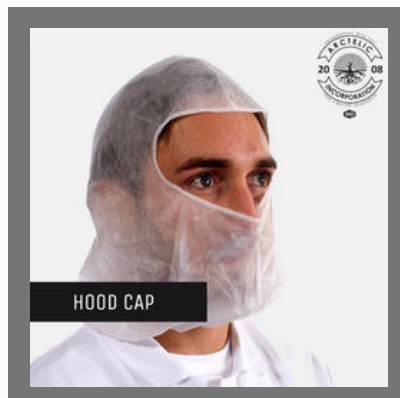
Disposable Hood Cap