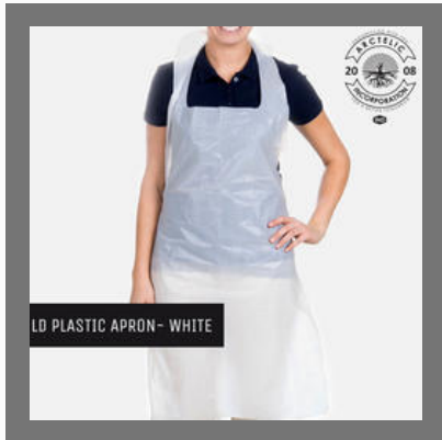
Disposable Plastic Apron