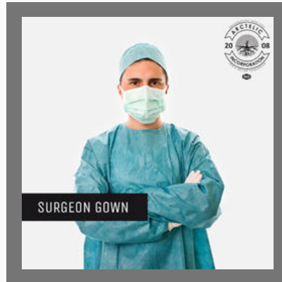
Disposable Surgeon Gown