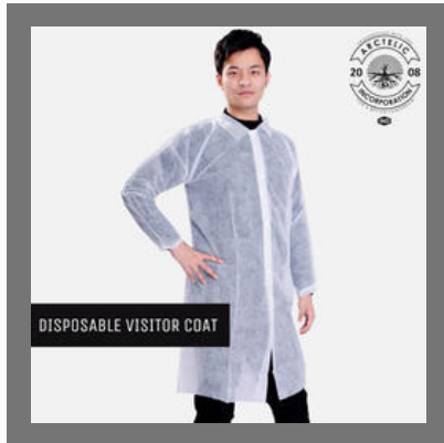
Non Woven Apron