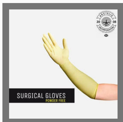
Surgical Gloves 16 Inch and 18 Inch