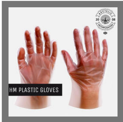
Disposable Plastic Gloves