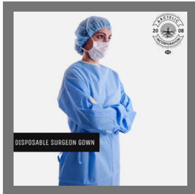
Non Woven Apron Surgeon Gown