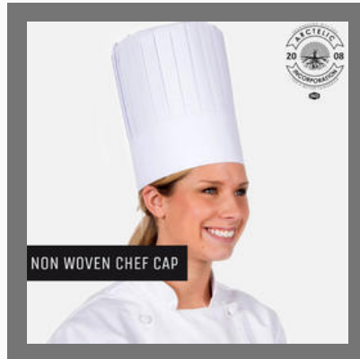
Non Woven Chef Cap