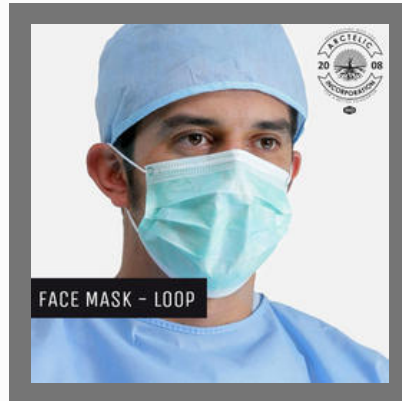
Disposable Face Mask