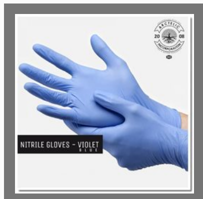
Violet Blue Nitrile Gloves