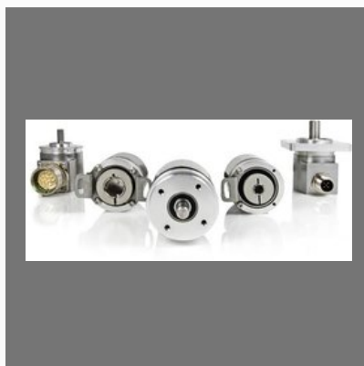
Absolute Rotary Encoders