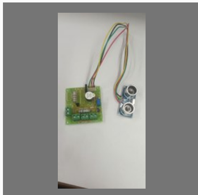
Ultrasonic Proximity Sensor