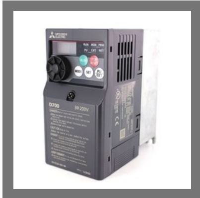
Mitsubishi AC Drive