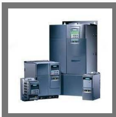
AC Drive Panel