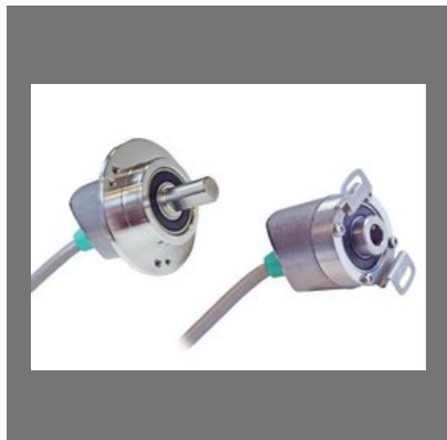
Incremental Rotary Encoders