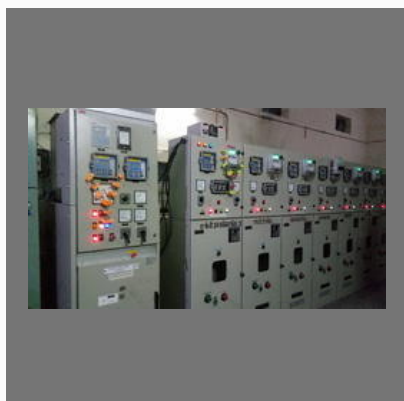
HT Line Panel