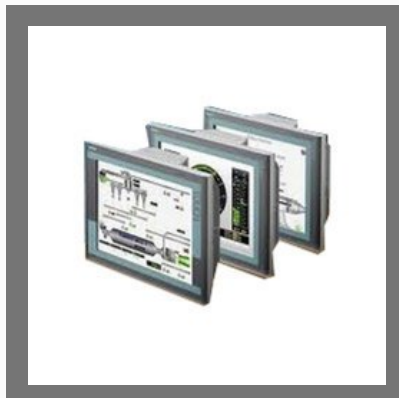
Touch Screen HMI