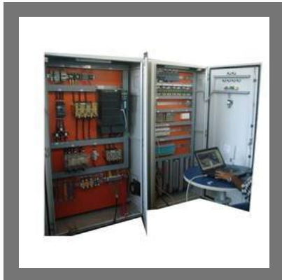
PLC Automation Panel