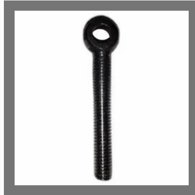
Gland Eye Bolt