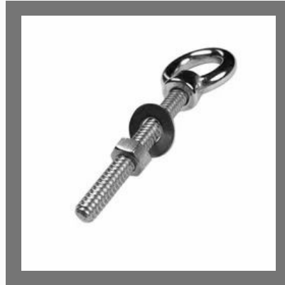
Heavy Duty Eye Bolts