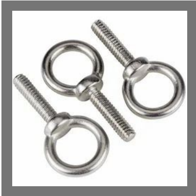
Stainless Steel Eye Bolt