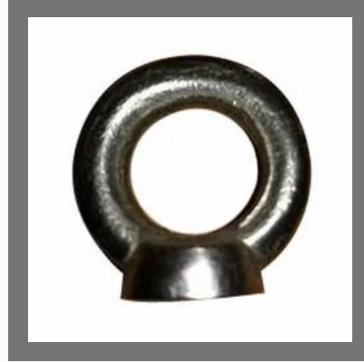
Mild Steel Eye Nut