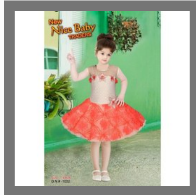
Kids Party Wear Cotton Frock