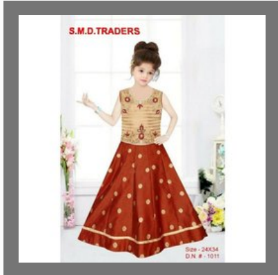
Kids Designer Sleeveless Gown