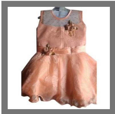
Kids Designer Frock