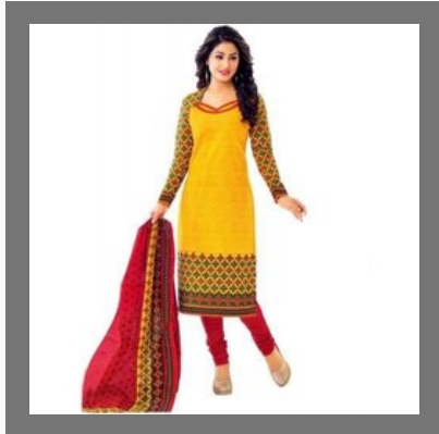
Ladies Printed Salwar Suit