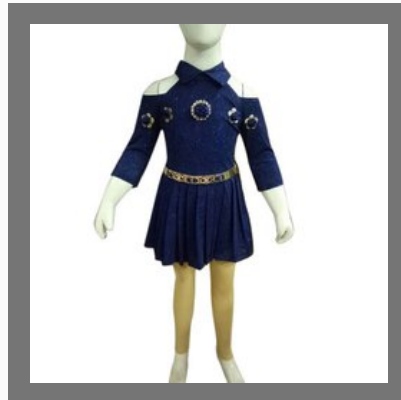
Kids Designer Frock With Legging