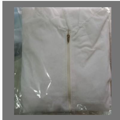
Non Woven Coverall