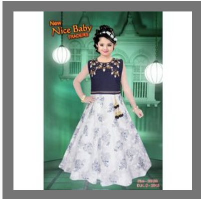
Kids Round Neck Gown