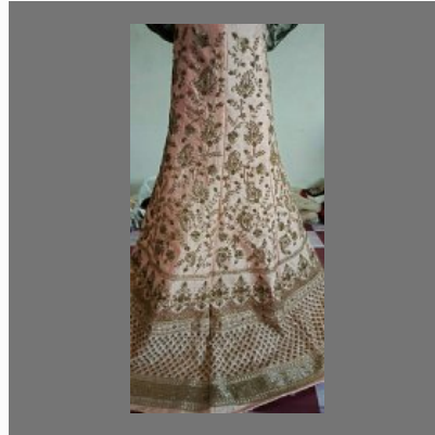
Wedding Lehenga Choli