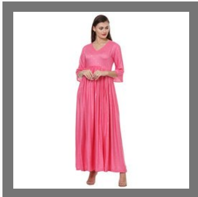
Ladies Long Gown