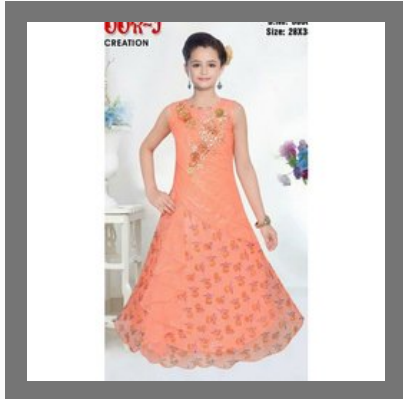
Kids Designer Party Wear Gown