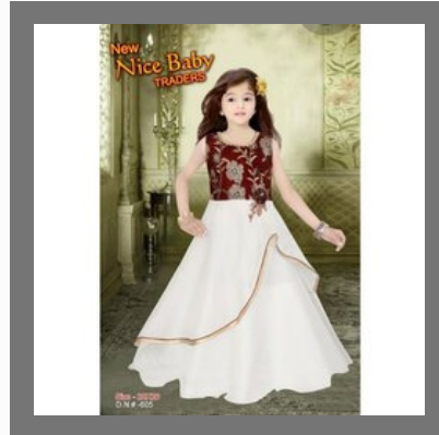
Kids Fancy Party Wear Gown