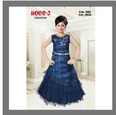
Kids Designer Blue Gown