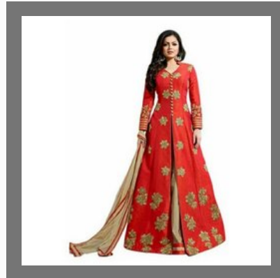
Ladies Floor Length Designer Suit