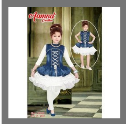
Kids Frock With Legging