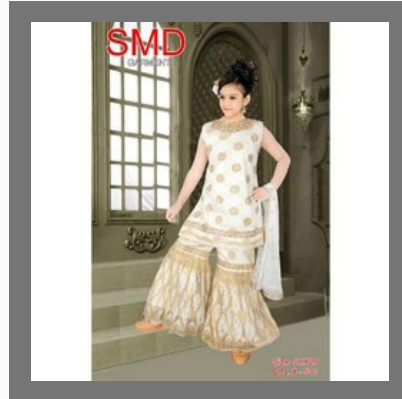
Kids Designer Sharara