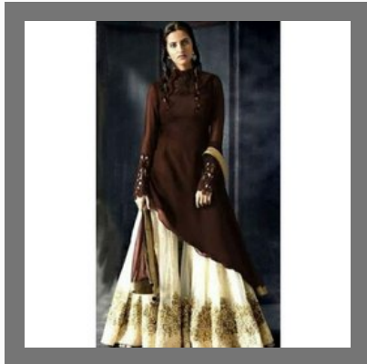
Ladies Designer Sharara