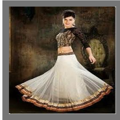
Anarkali Chicken Lehenga