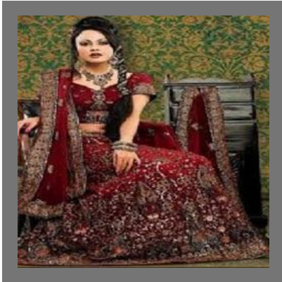
Fancy Chicken Lehenga