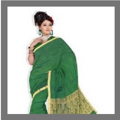
Printed Chicken Saree