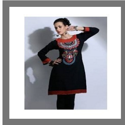
Full Embroidered Chicken Kurti