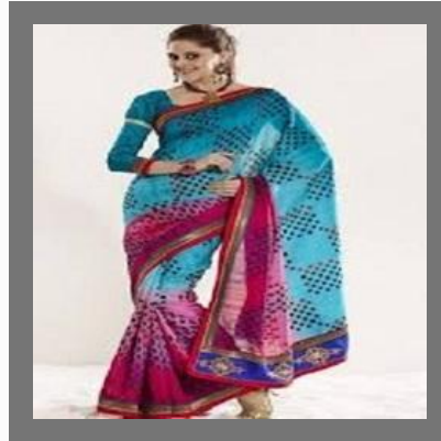
Printed Silk Sarees