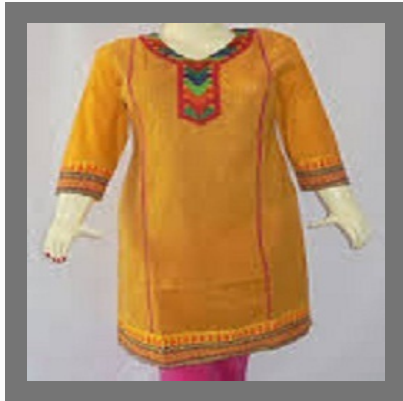
Cotton Ladies Kurtis