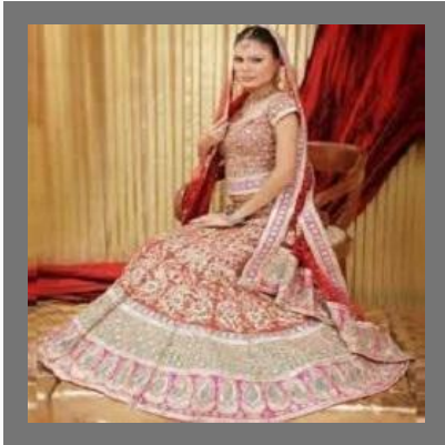
Bridal Chicken Lehenga