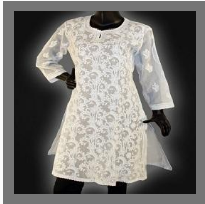
Designer Ladies Kurtis