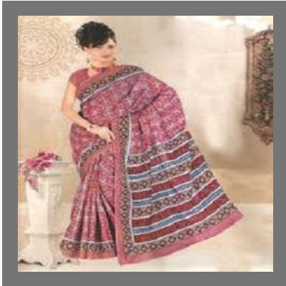
Printed Cotton Sarees