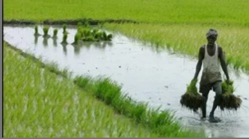
Agree Land Financial Solutions