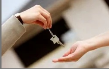
Leasing And Property Management