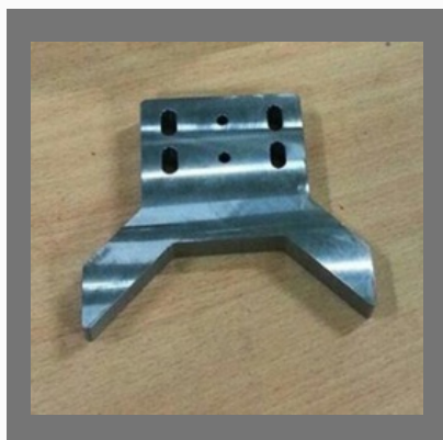
CNC Machine Works