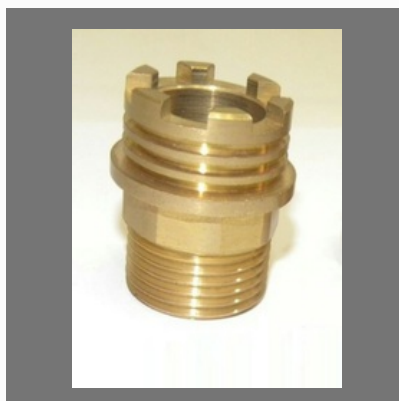
Precision Turned Components