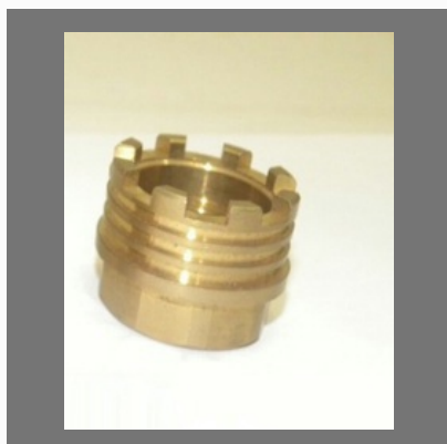
Precision Turned Components