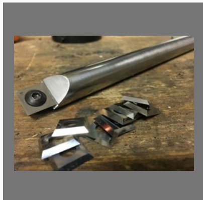
Lathe Cutting Tool