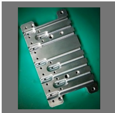
CNC Machine Works