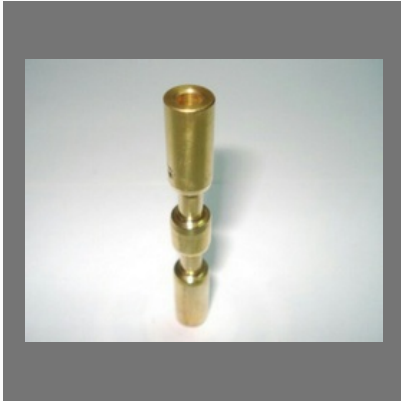
Brass Turned Components