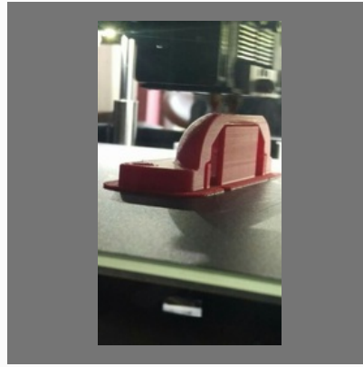
Plastic Die Mould