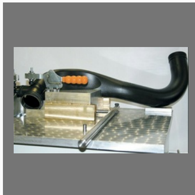
Jigs And Fixtures