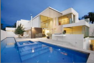
Design & Construct Buildings