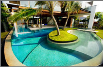
Landscaping and decorating Environment