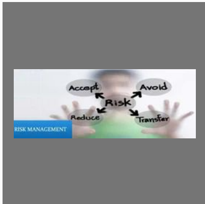
Insurance Advisory Services