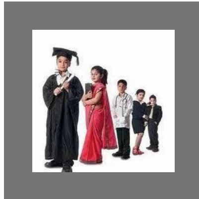
Child's Future PlanningS