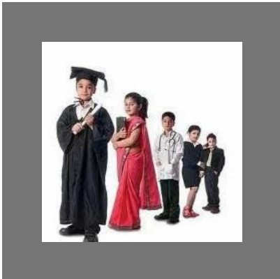
Child's Future Plannings