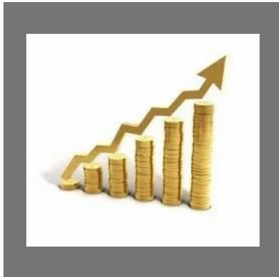
Stock Advisory Services