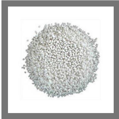
Milky LD Granules