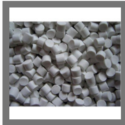
ABS Plastic Granules