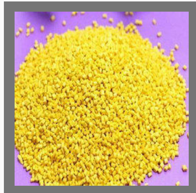
Yellow PP Granules