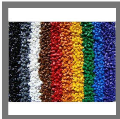
Colored Plastic Granules