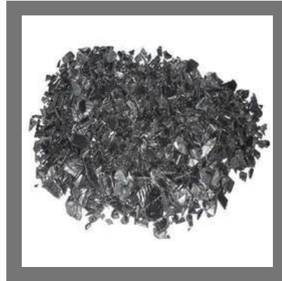
PC UF Black Grinding