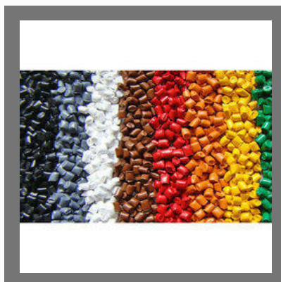
Reprocessed PP Plastic Granules