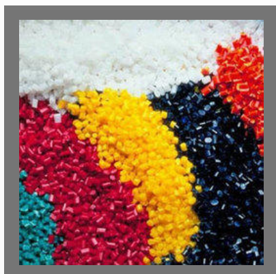
Reprocessed HDPE Granules