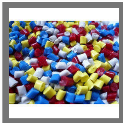
HD Plastic Granules