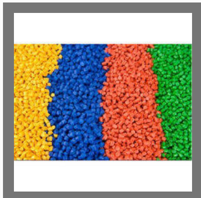
PP Color Granules