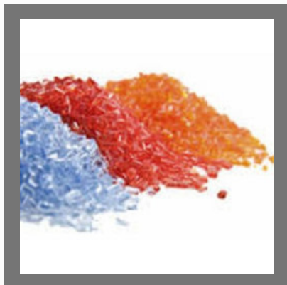
PC Plastic Granules