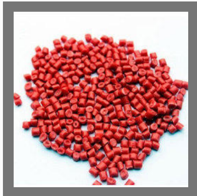
PP Red Plastic Granules