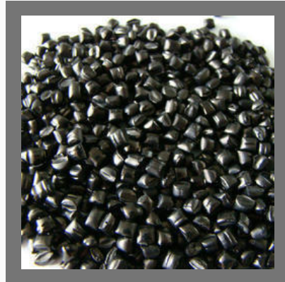
PP Black Granules