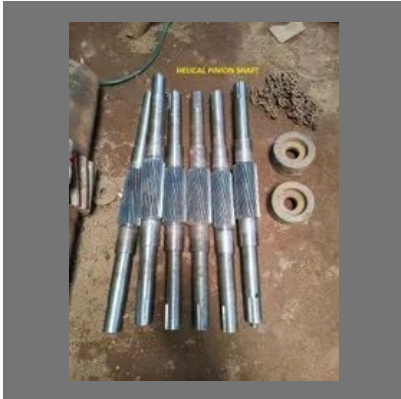
Helical Pinion Gear Shaft