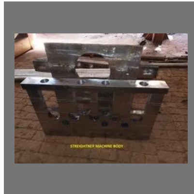
Straightener Machine Body