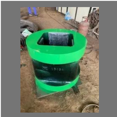
Sq. Bar Coupling For Sugar Mill