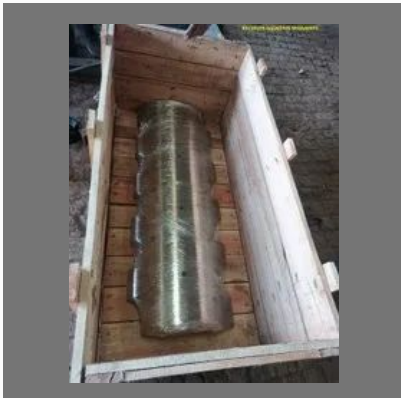
Recoiler Mandrel Segment