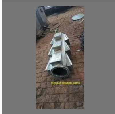
Recoiler Mandrel Sleeve