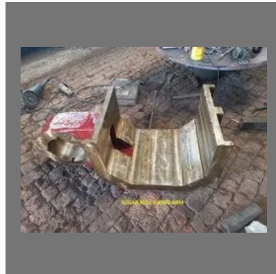
Sugar Plant Swing Arm