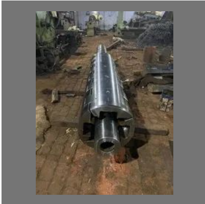
Mandrel Recoiler Machine