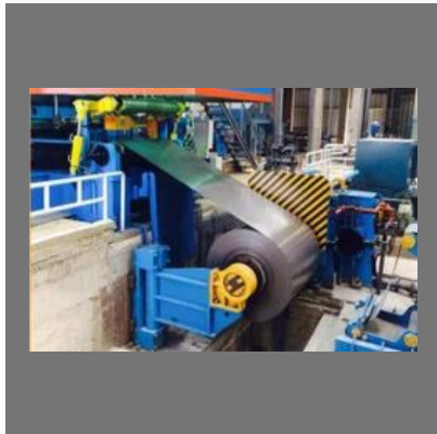
Hot and rolling mill