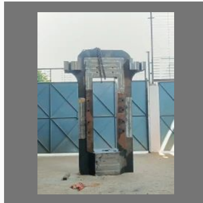
Steel Rolling Mill Stand