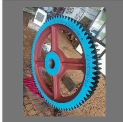
Industrial Gear Wheel