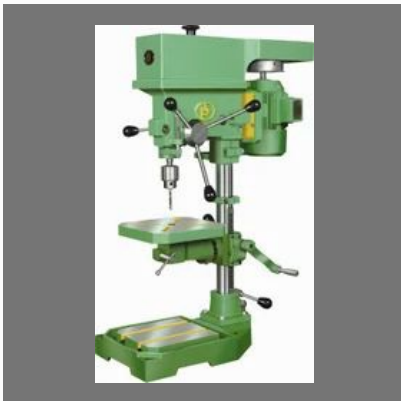
All Types Of Drilling Work