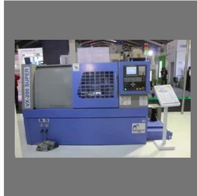
All Types Of CNC Works