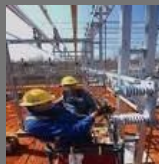
Industrial Work Service