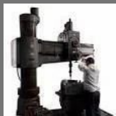
Drilling Job Work