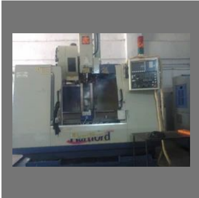
All Types of VMC M/C Job Works