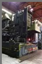
Heavy Engineering Works