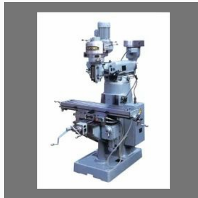
M1TR Job Works