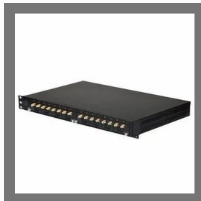
16-Port GSM Gateway