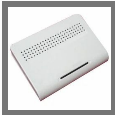
USB Voice Logger