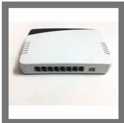
8 Port USB Voice Logger