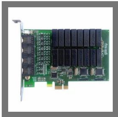
PC Voice Logger