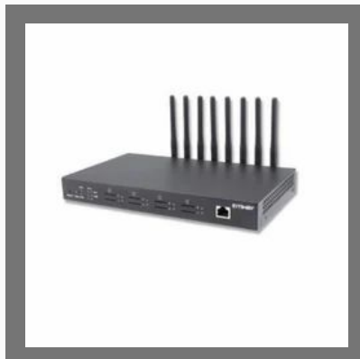
VoIP Gateway and SBC