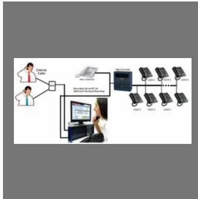
Registro Voice Logging Solution