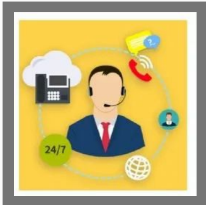
Auto / Progressive Dialer