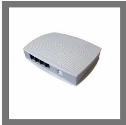
PC Based Voice Logger