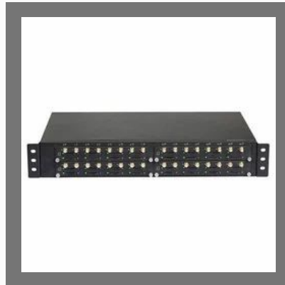
32 Ports GSM Gateway