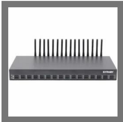
GSM Voip Gateway