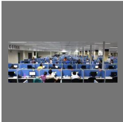
Convoque Complete Call Centre Suite