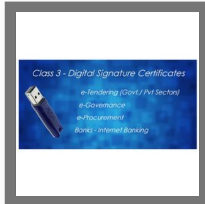
Class 3 Digital Signature Service