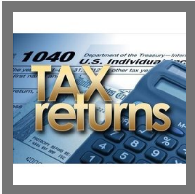
Business Income Tax Return Service