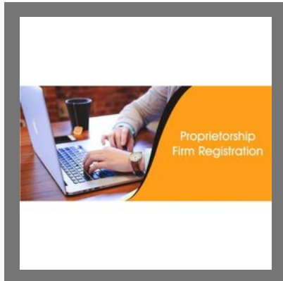
Proprietorship Company Incorporation Service