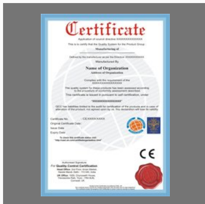
CE Marking Certificate