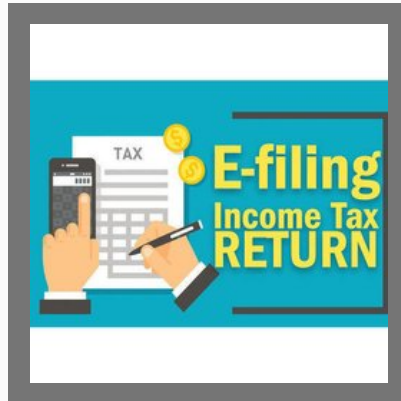
Salary Income Tax Return Service