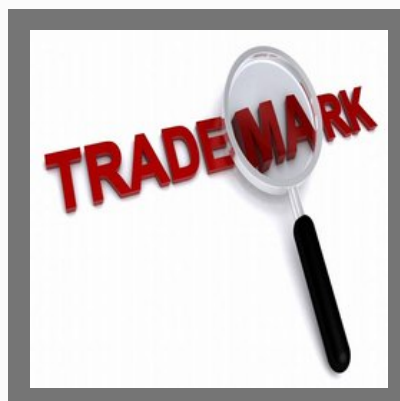
Trademark Registration Service