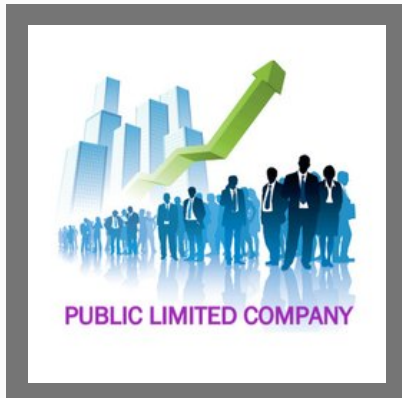
Public Limited Company Incorporation Service