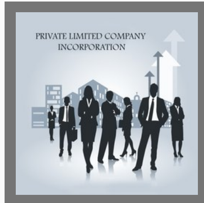
Private Limited Company Incorporation Service