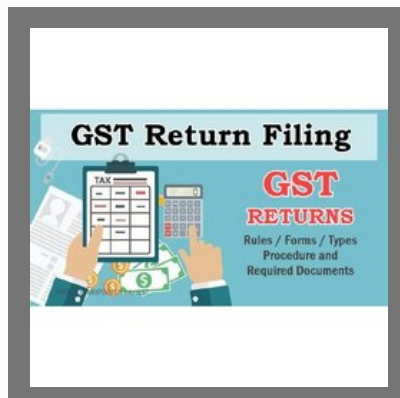
GST Return Filing Services