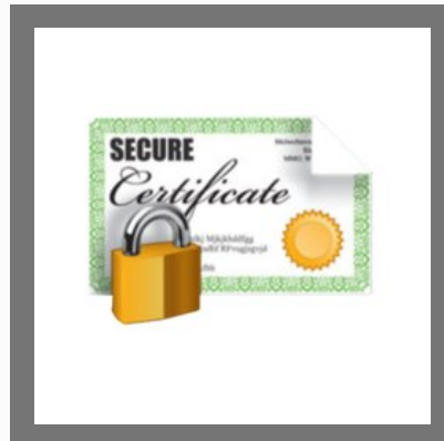
DGFT Digital Signatures Service