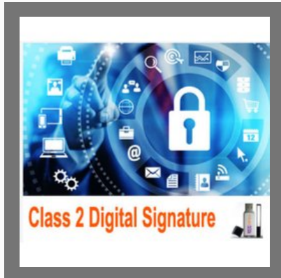
Class 2 Digital Signature Renewal Service