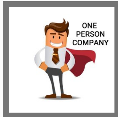
One Person Company Incorporation Services