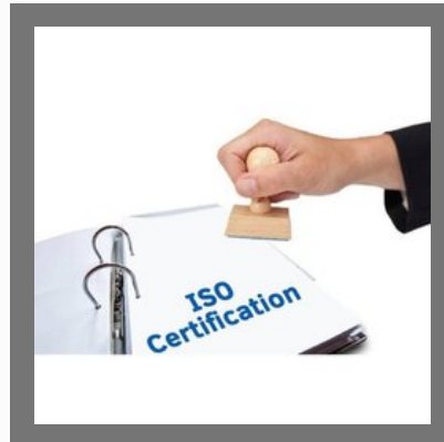
ISO Certification Services