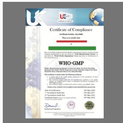
WHO-GMP Certification Services