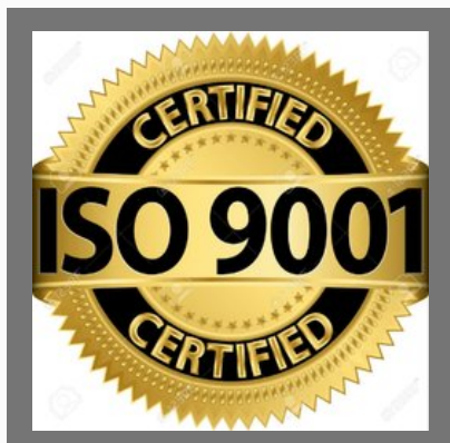
ISO 9001 :2015 Certification Service