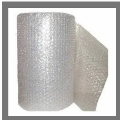
8mm Air Bubble Roll