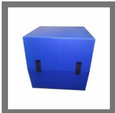
Blue Polypropylene Corrugated Box