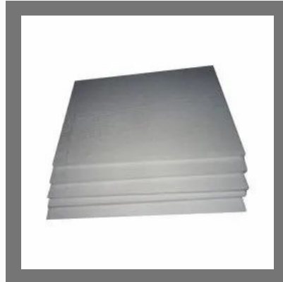
20mm Thermocol Sheet