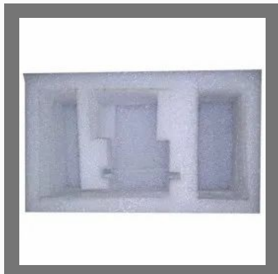
Rectangular EPE Foam Fitment Box