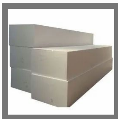
White Thermocol Block