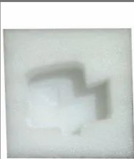
4mm Thermocol Foam Fitment Box