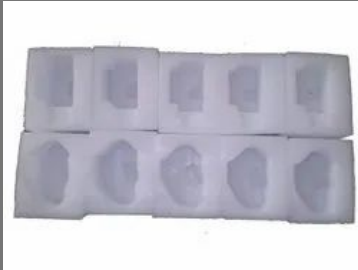
EPE Foam Fitment Box