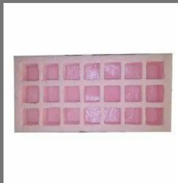
50mm EPE Foam Fitment Box