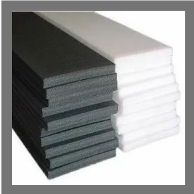
20 Mm Polyurethane Foam Sheet