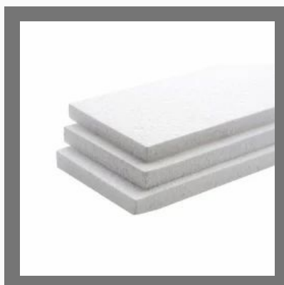
25 Mm Polyurethane Foam Sheet