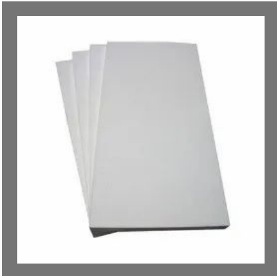
15 mm Thermocol Sheet