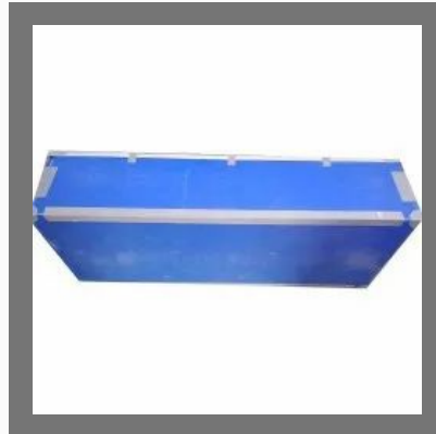
PP Corrugated Box