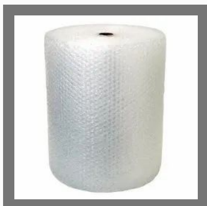
40 GSM Packaging Air Bubble Roll