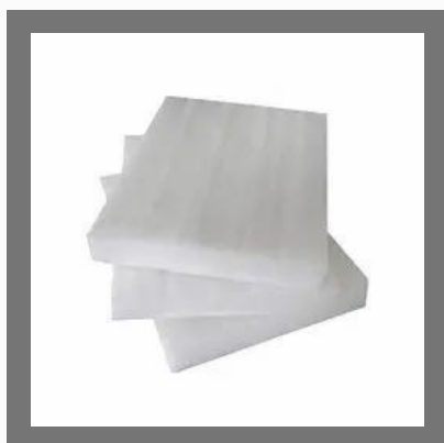
Starpack EPE Foam Sheet