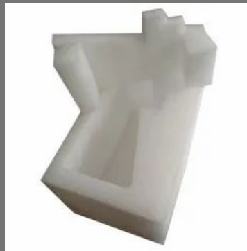
10 Inch EPE Foam Fitment Box