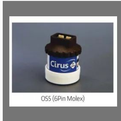
OS5 (6Pin Molex)

Oxygen Sensor For Dragger Fabius / Evita