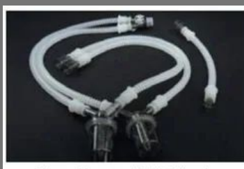
Silicon Neonatal DWT Circuits