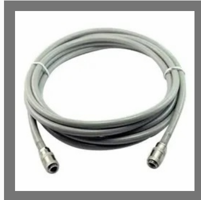
NIBP Single Tube Hose