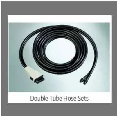
NIBP Double Tube Hose