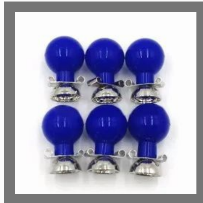
ECG Bulb Set