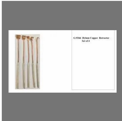
Hylum Copper Retractor