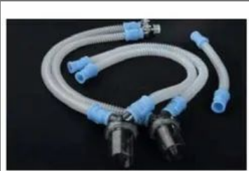
Silicon Adult DWT Circuits