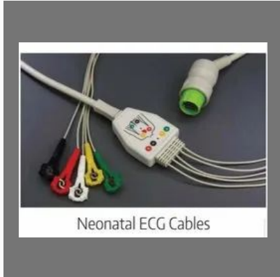
5 Lead ECG Cable