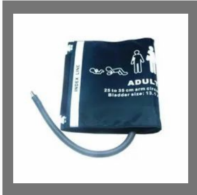
NIBP Single Tube Cuff