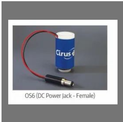
OS6 (DC Power Jack - Female)

Oxygen Sensor For Maquet Servo I / Servo S Ventilator