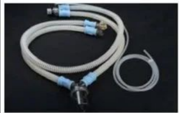
Silicon Pediatric Heated Wire Circuits

Ventilator Breathing Circuit with Heated wire