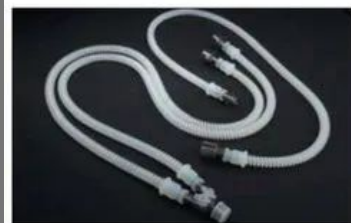
Silicon Neonatal Anesthesia Circuits

Ventilator Breathing Circuit with Heated wire