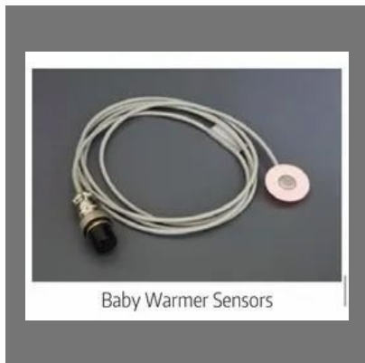
Infant - Warmer - Temperature - Sensor