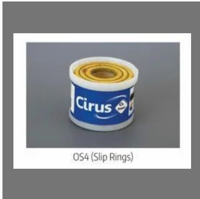
OS4 (Slip Rings)

Oxygen Sensor For Dragger Fabius / Evita