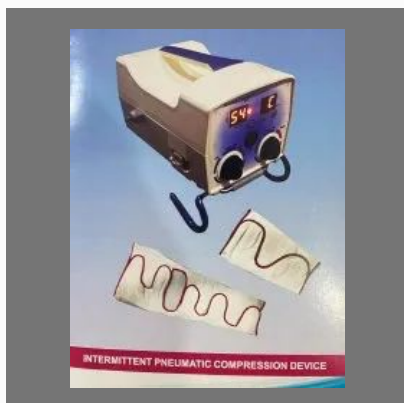
DVT Pump Rental Services