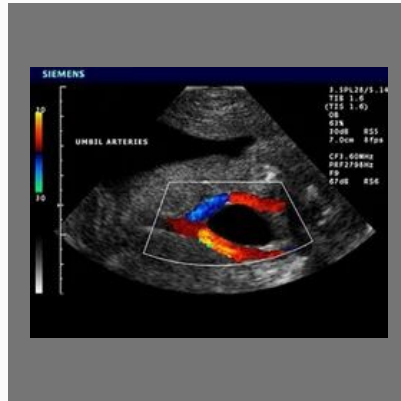
Radiology- Colour Doppler