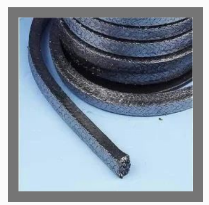
Expanded Graphite Wire Gland Packing Gland