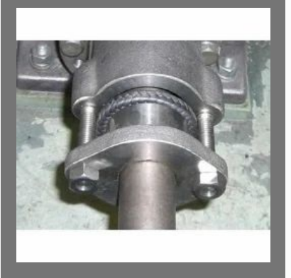
12 mm Gland Packing