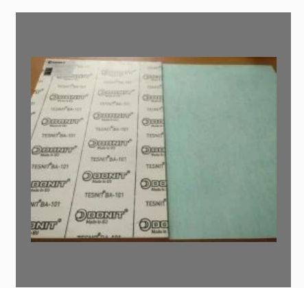
DONIT Tesnit BA 101 100% Asbestos Free Certified Gasket Sheet