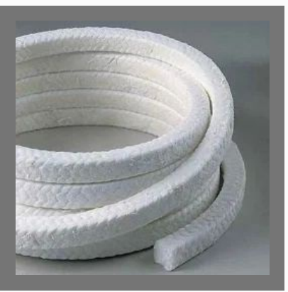
PTFE Gland Packing Gland