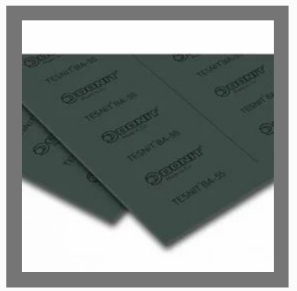
Donit Tesnit BA 55 Non Asbestos Gasket Sheet