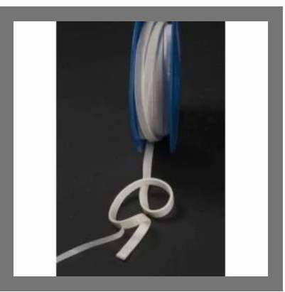
Expanded Pure PTFE Joint Sealant