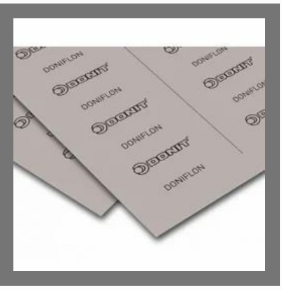
Donit Doniflon 900E Expanded PTFE Sheet