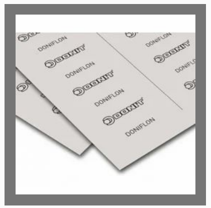
Donit Doniflon 2030 Expanded PTFE Sheet