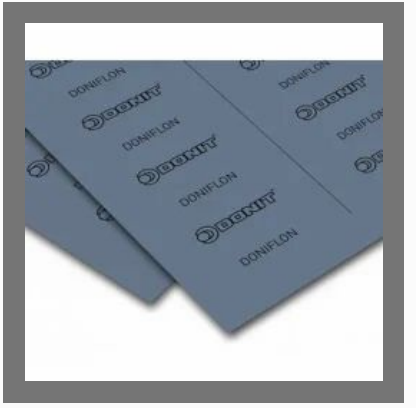
Donit Doniflon 2010 Hollow Glass Microbeads Expanded PTFE Sheet