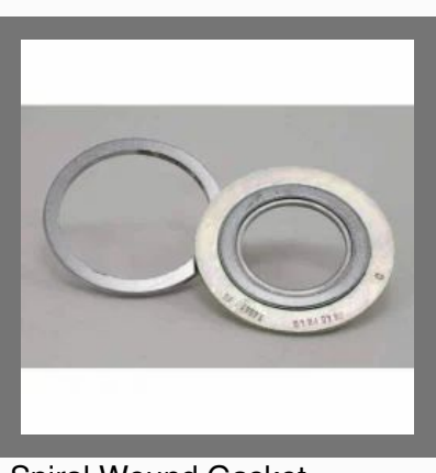
Spiral Wound Gasket