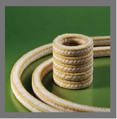
PTFE Aramid Braided Packing Gland