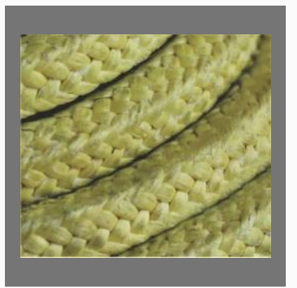
Non Asbestos Aramid Packing Gland