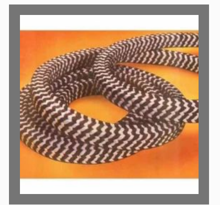
Zebra PTFE Packing Gland