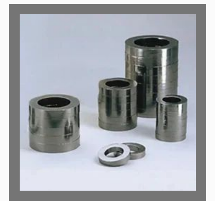
Pure Graphite Rings