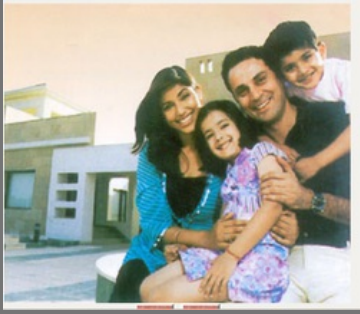
Group Health Insurance