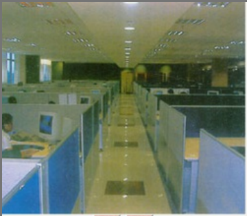
Logistic Insurance Service