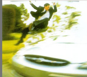
Logistic Insurance Services