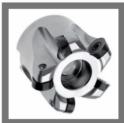
Face Milling Cutter