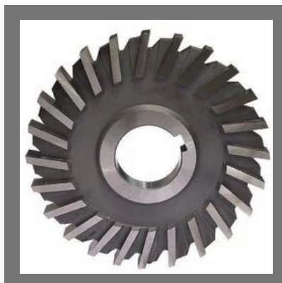
Circular Milling Cutter