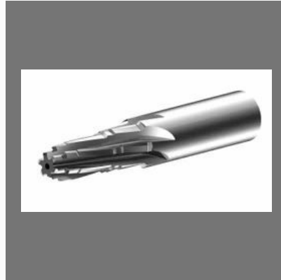
Carbide Step Reamer