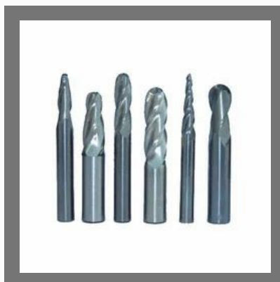
CNC Cutting Bit