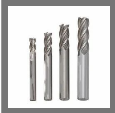
HSS Cutting Tool