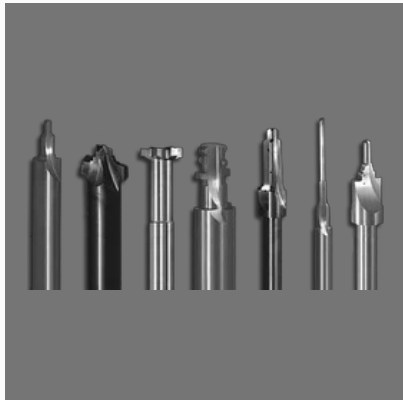
Carbide Spl Tools