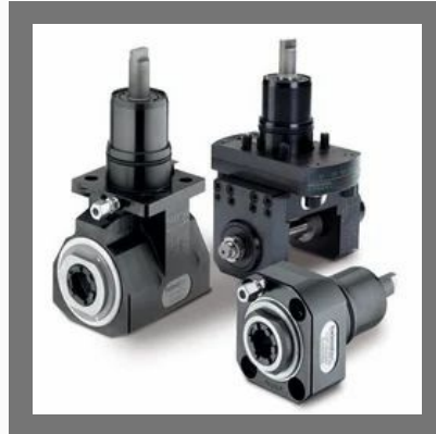
CNC Live Tool