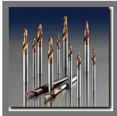
CARBIDE STEP DRILL