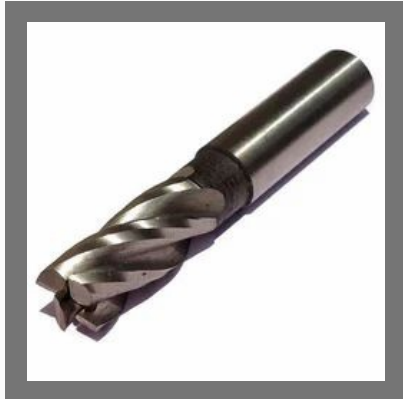
End Mill Cutter