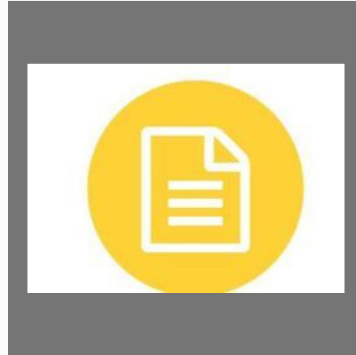
Claims Investigation Service