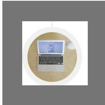
Transition Insurance Services to Full Service