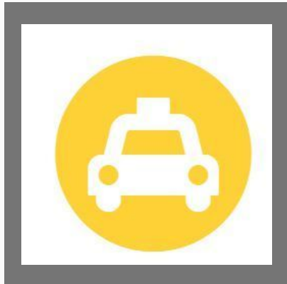
Third Party Insurance Service