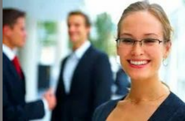
Return Filing Services