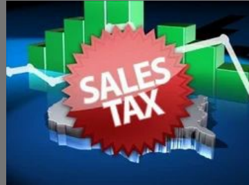
Sale Tax/ Vat Return