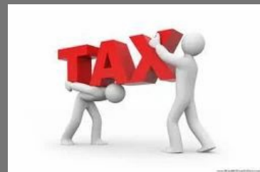
Income Tax Consultant