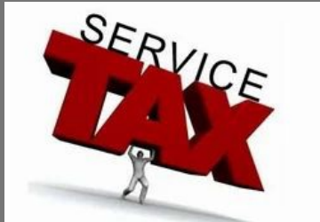
Service Tax Registration