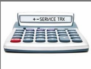
Service Tax Return Filing