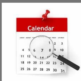
Annual ROC Filings