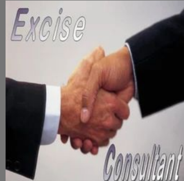
Excise and Custom