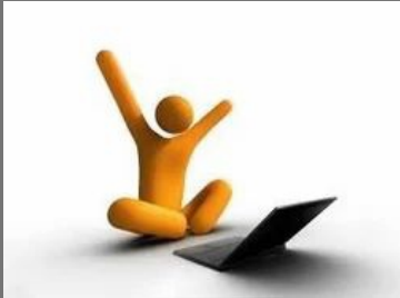
Income Tax Return Filing