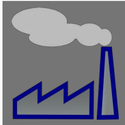
Excise Return Filings