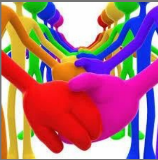
LLP Registration/ Partnership Registration