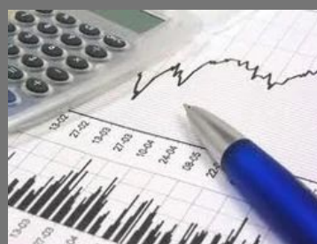
Work Flow for Accounting Outsourcing