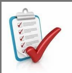
Compliance Related Roc Filings