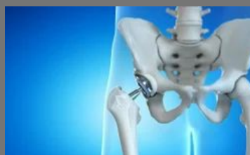
Hip Resurfacing Surgery