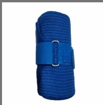
Sky Blue Cotton Crepe Bandage