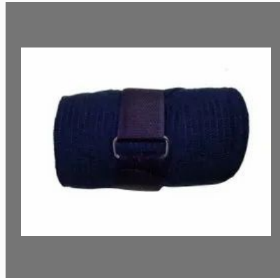
Navy Blue Cotton Crepe Bandage