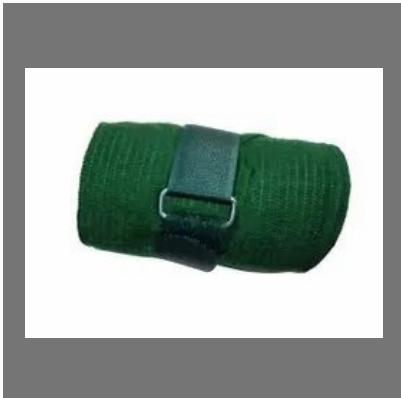
Green Cotton Crepe Bandages