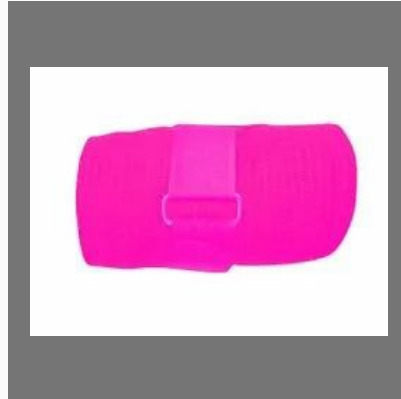
Pink Cotton Crepe Bandages