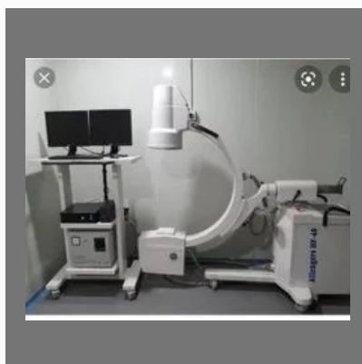
ACL Ligament Surgery only 5000 per month.