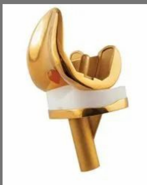
Total Knee Replacement Service