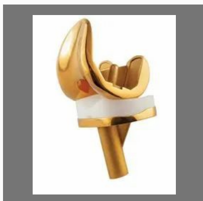
Knee Joint Pain Treatment