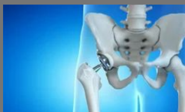
Hip Joint Replacement Surgery life 25 years