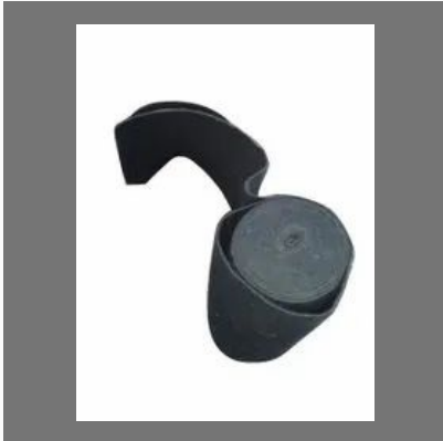
Black Cotton Crepe Bandages