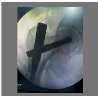
Bone Joint Fracture Surgery