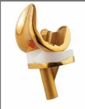
Knee Pain Treatments Services