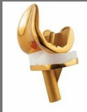
Titanium Knee Replacement