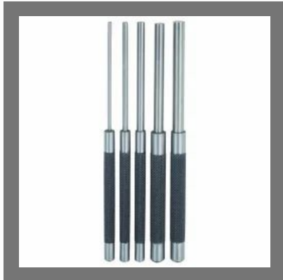
Long Drive Pin Punch - 5 Piece Set