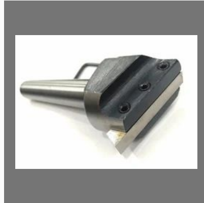
Fly Cutter MT2 Shank M10x1.5mm Db Thread 38mm Head DIA 5/16 HSS Tool Bit