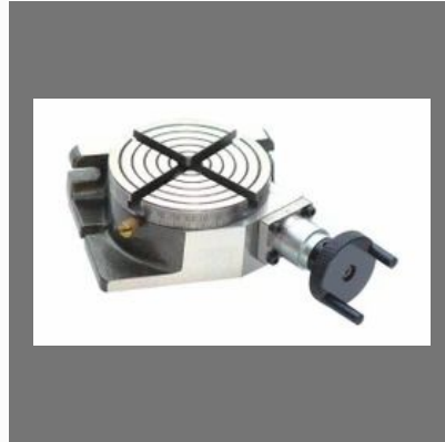
Horizontal / Vertical Rotary Tables 4"/100mm