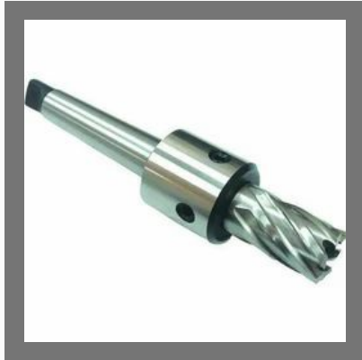
Broach Cutter Holder