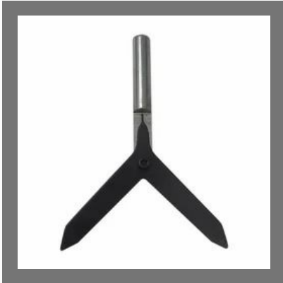
Round Bar Center Finder