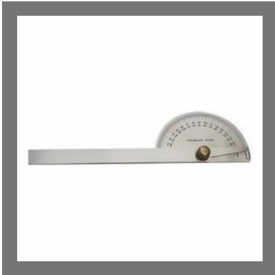
Round Head Protractor