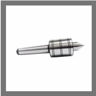
Revolving Center For Conventional Lathe