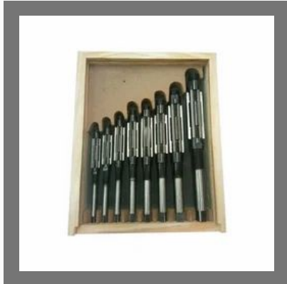
Adjustable Hand Reamer Set