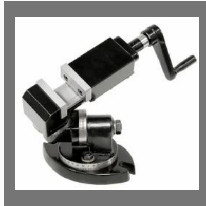
Precision Universal Machine Vise 2"/50mm