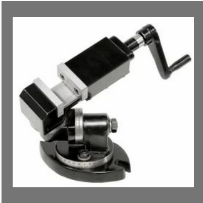
Precision Universal Machine Vise 3"