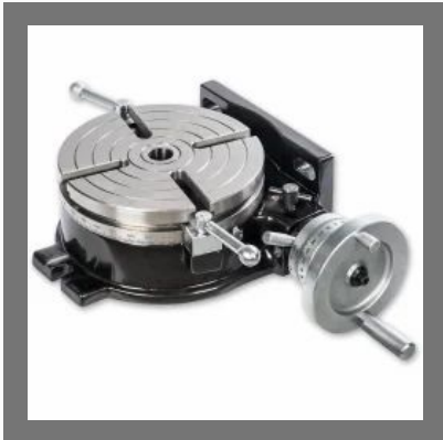
Horizontal / Vertical Rotary Table 5" / 125mm