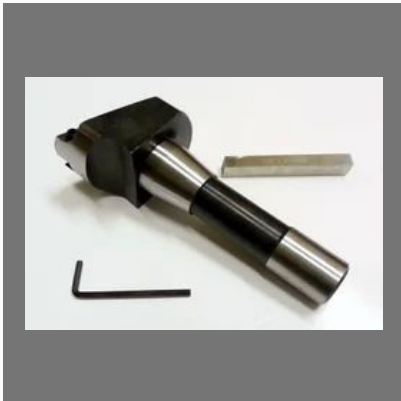
Fly Cutter R8 Shank (7/16 UNF Drawbar Thread) 2-1/2" Head Dia. Bit 5/16"