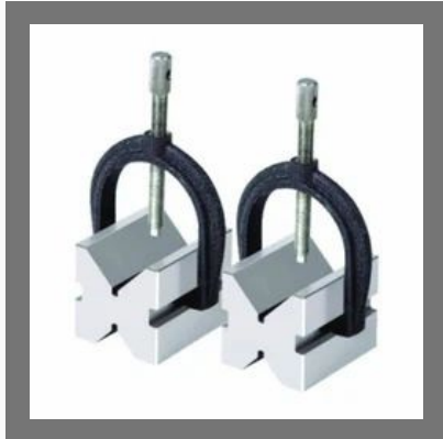
Precision Vee Blocks Matched Pairs