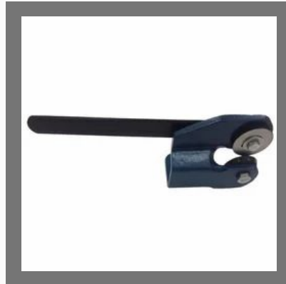
Portable Hand Shear