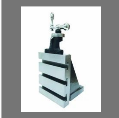
Fixed Base Vertical Slide