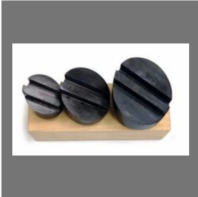
Fly Cutter 3/4" Shank - 3PC Set