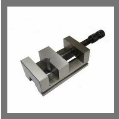
Drilling Machine Vise