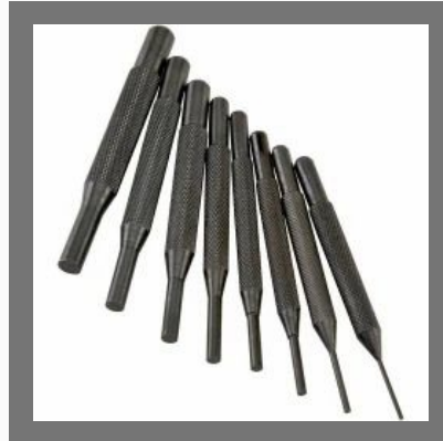
Drive Pin Punch Set - 8 Piece Set