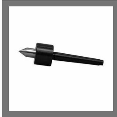
Mini Revolving Center