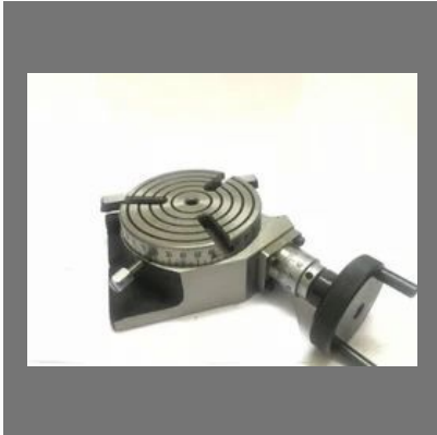
Horizontal & Vertical Rotary Table 3" / 75mm