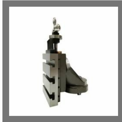
Swivel Base Vertical Slide