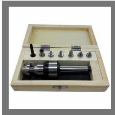
Multi Point Revolving Center