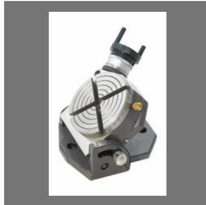
Tilting Horizontal / Vertical Rotary Table 4"/100mm