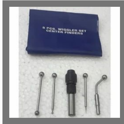
Wiggler And Center Finder Set