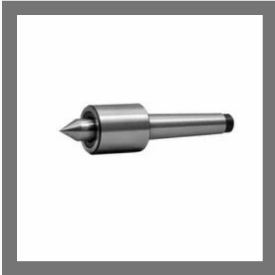
Slim Body / Low Body Revolving Center