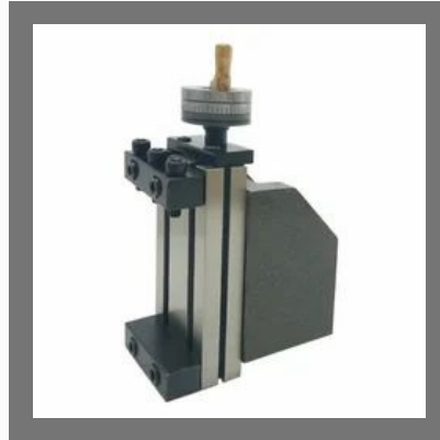
Mini Vertical Slide